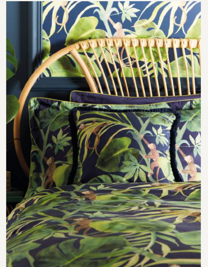
Top to Bottom: Monkey Business wallcovering indigo, Monkey Business bedlinen set indigo, velvet cushions made from Alvar navy and hunter, Monkey Business cushion