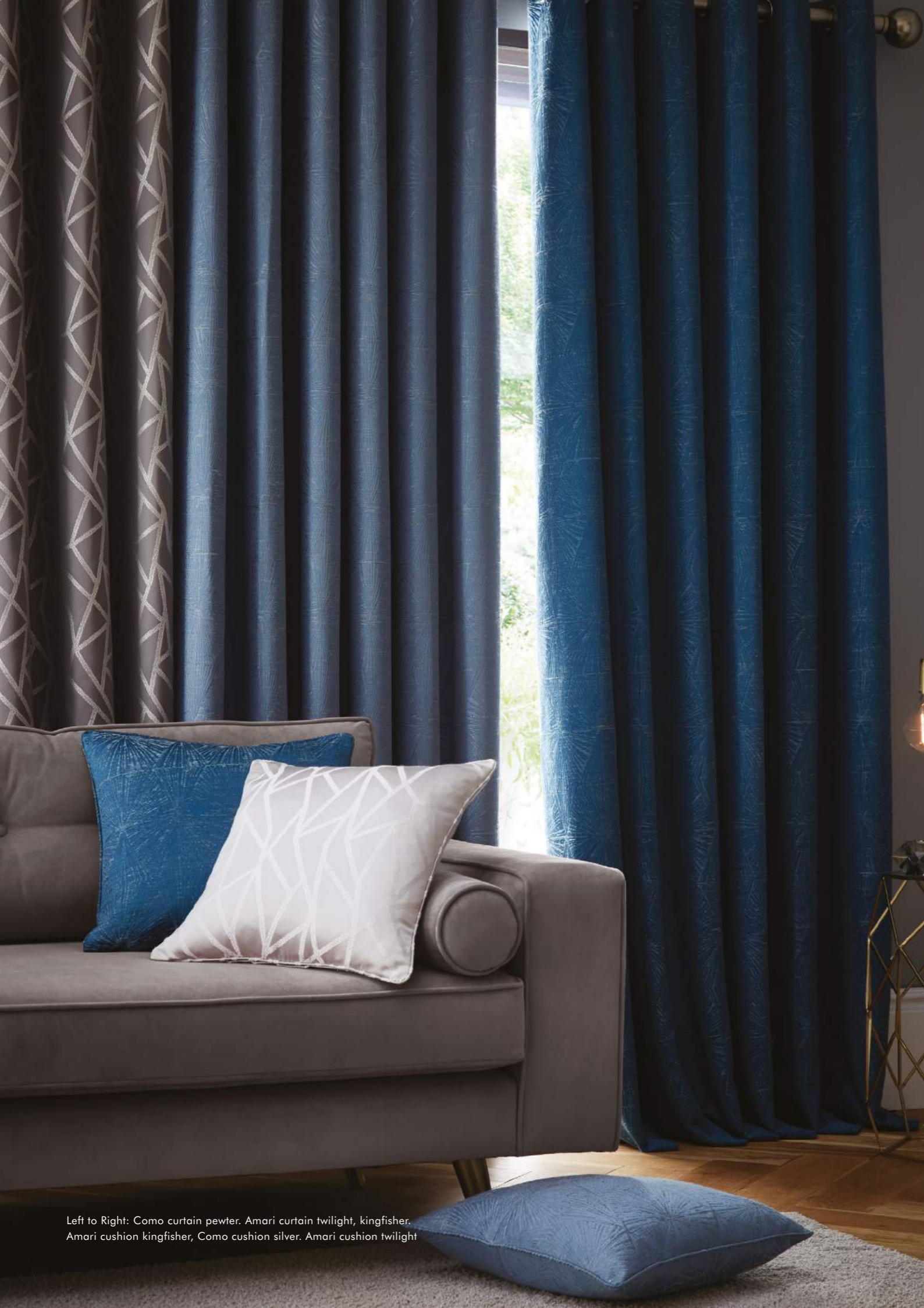
Left to Right: Como curtain pewter. Amari curtain twilight, kingfisher. Amari cushion kingfisher, Como cushion silver. Amari cushion twilight