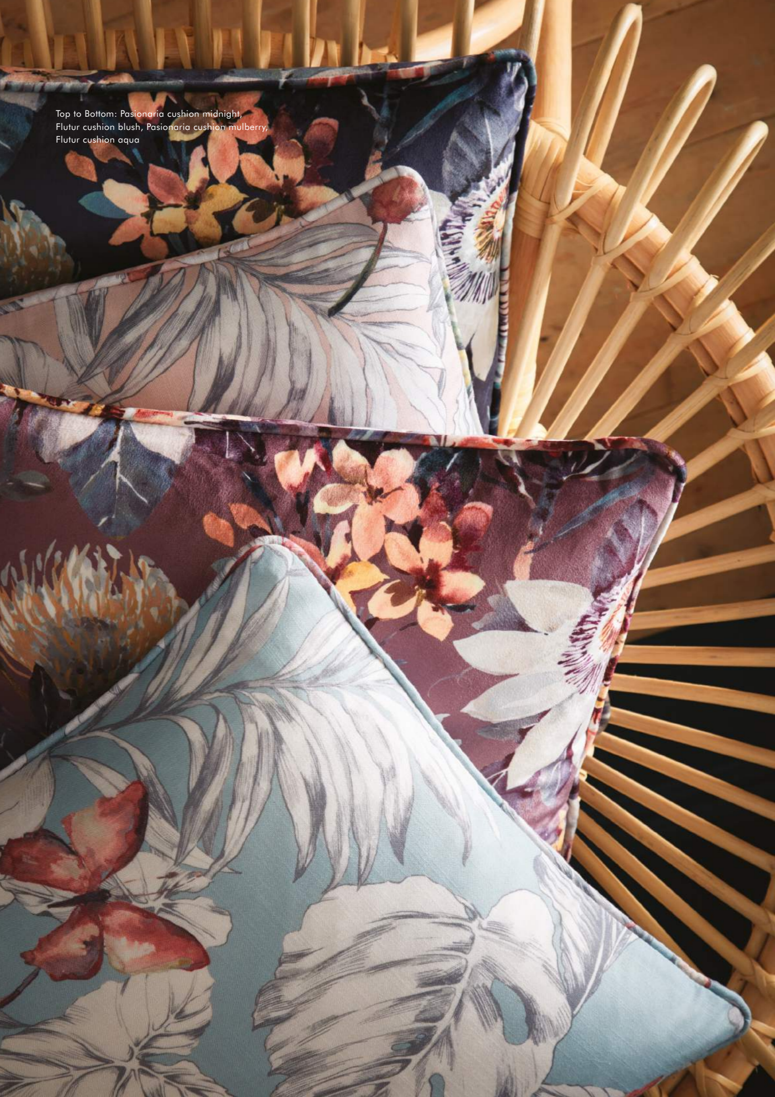
Top to Bottom: Pasionaria cushion midnight, Flutur cushion blush, Pasionaria cushion mulberry, Flutur cushion aqua