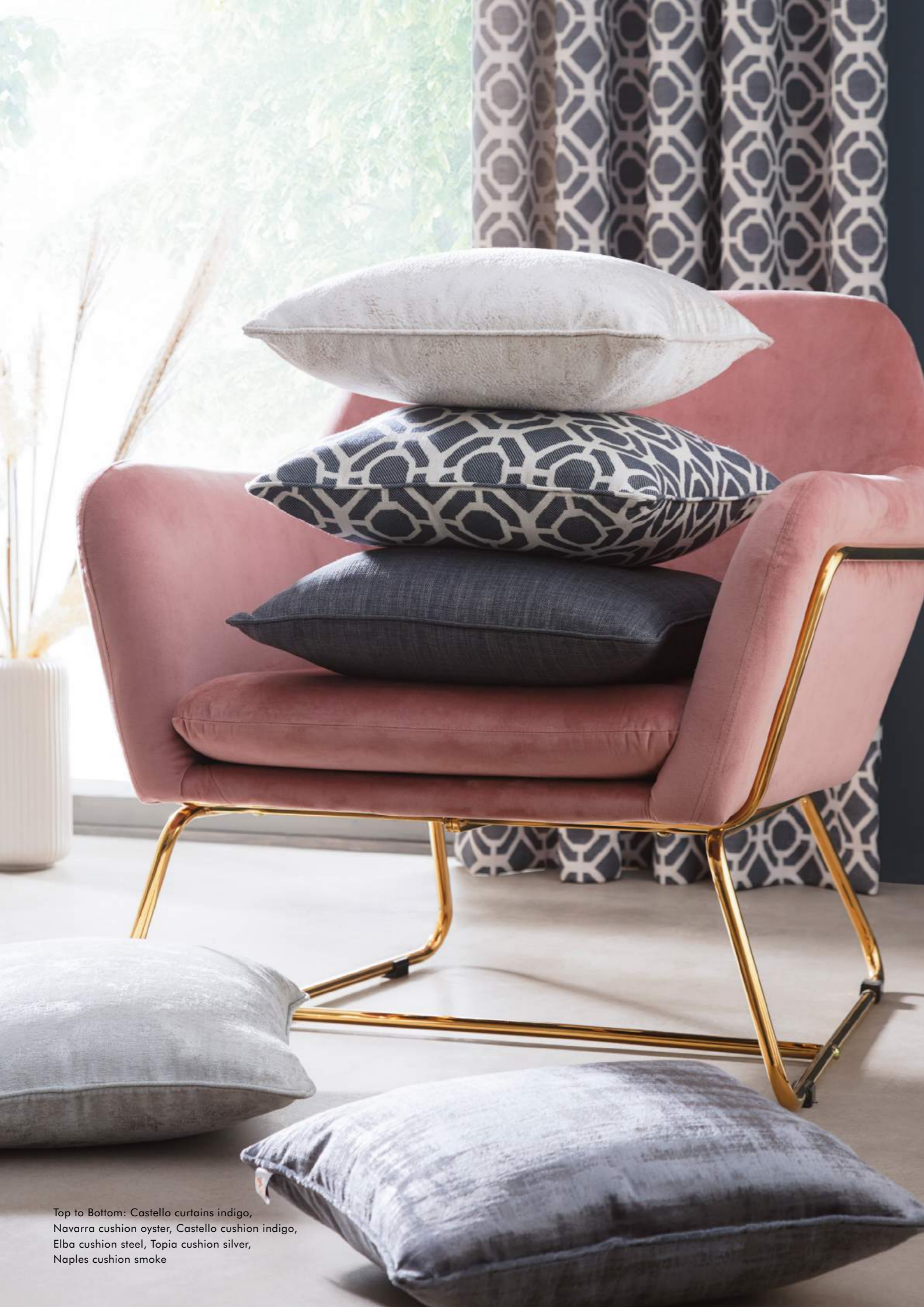
Top to Bottom: Castello curtains indigo, Navarra cushion oyster, Castello cushion indigo, Elba cushion steel, Topia cushion silver, Naples cushion smoke