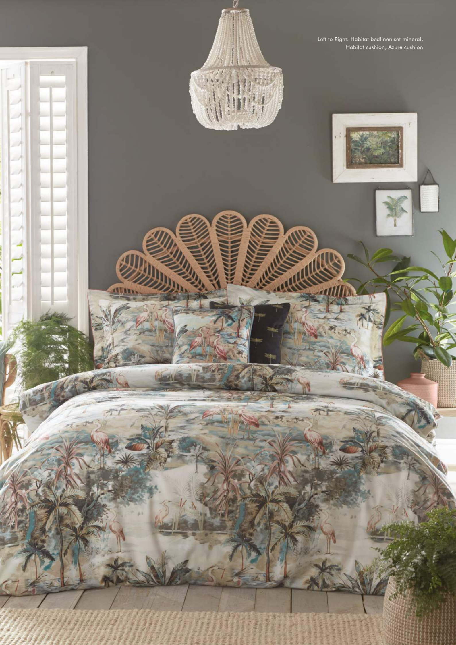
Left to Right: Habitat bedlinen set mineral, Habitat cushion, Azure cushion