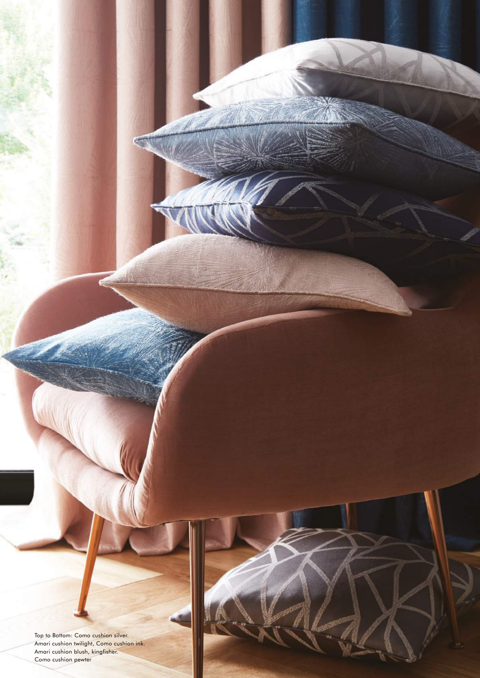
Top to Bottom: Como cushion silver. Amari cushion twilight, Como cushion ink. Amari cushion blush, kingfisher. Como cushion pewter