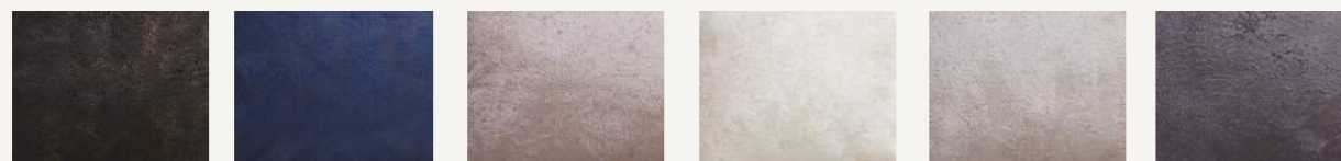
EBONY INDIGO MINK OYSTER SILVER SLATE