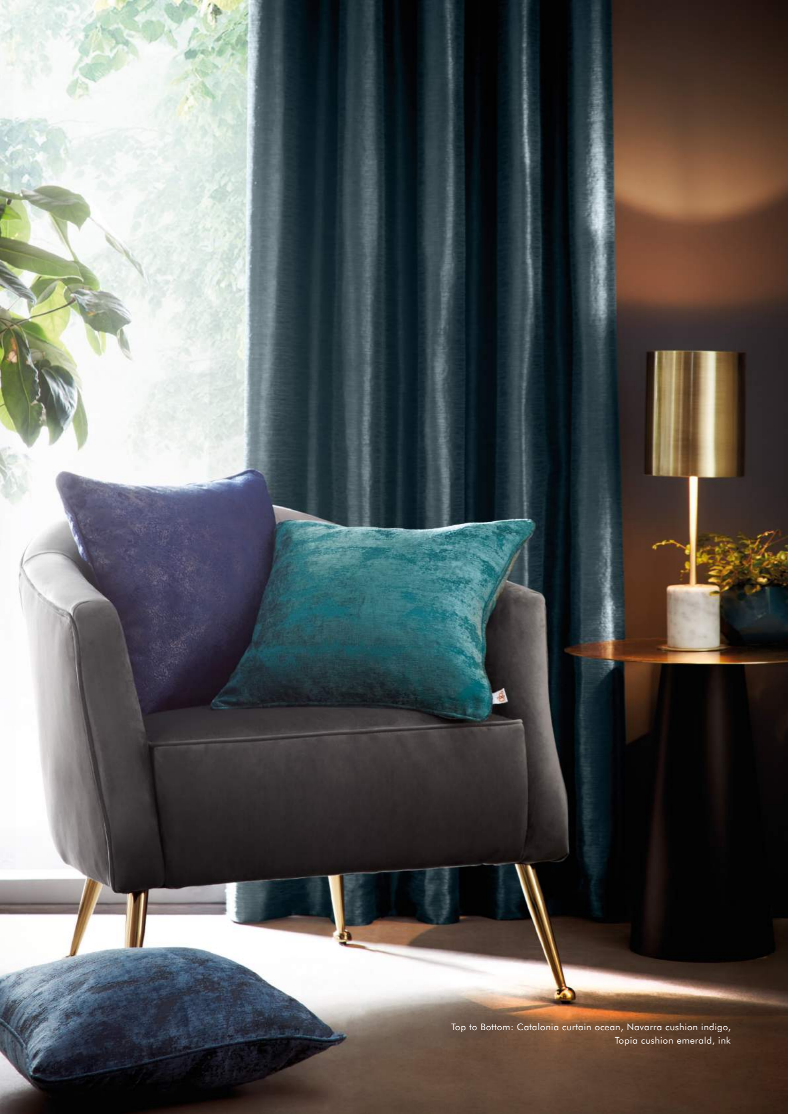
Top to Bottom: Catalonia curtain ocean, Navarra cushion indigo, Topia cushion emerald, ink