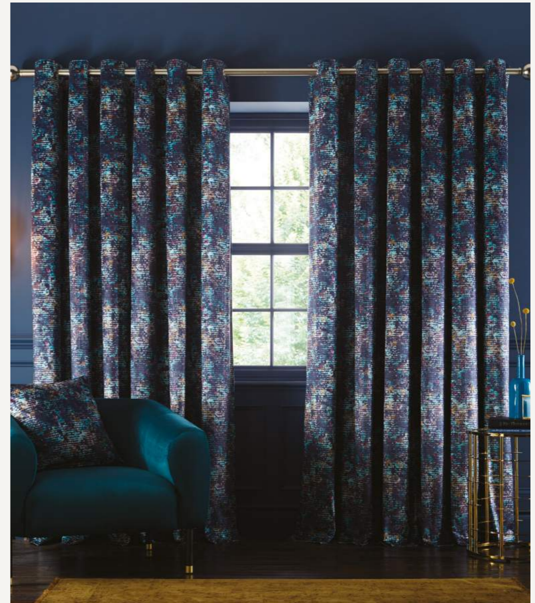
Left to Right: Dalston chair Rugosa damson, Bouquet cushion kingfisher, Eclipse cushion midnight, Bouquet curtain kingfisher, Eclipse curtain midnight

Eclipse is a spirited moment of colour in a dark midnight sky. The design plays on distorted pixels that take the palette of blues, burnt oranges and pops of cherry to new dimensions. A white polycotton lining finishes the curtains.