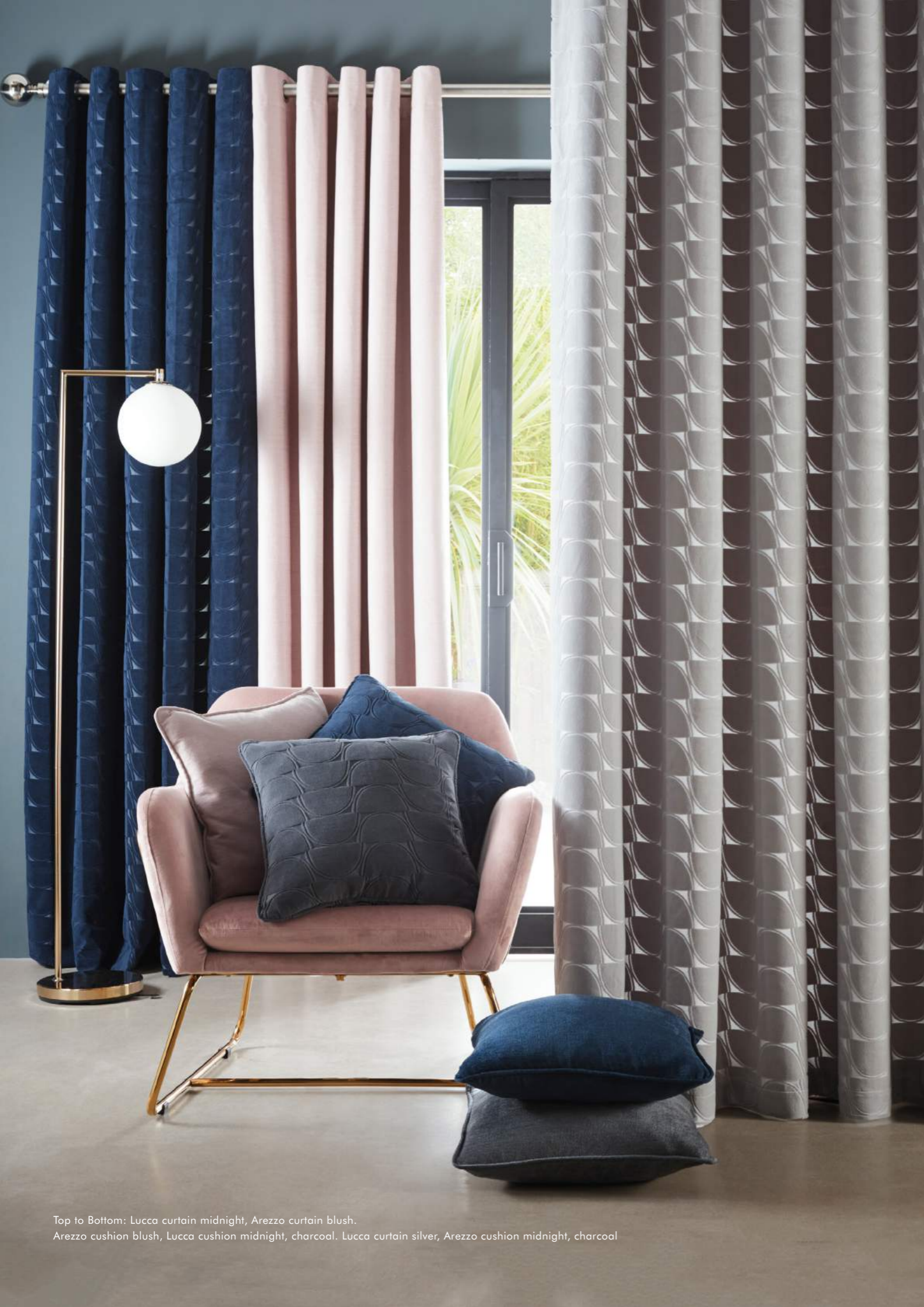
Top to Bottom: Lucca curtain midnight, Arezzo curtain blush. Arezzo cushion blush, Lucca cushion midnight, charcoal. Lucca curtain silver, Arezzo cushion midnight, charcoal