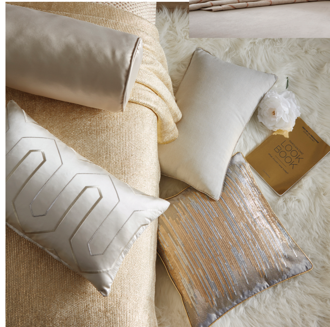
Above left to right: Splatter Foil print cushion, Knit throw gold, Bolster cushion mink, Diamante Trim boudoir, Phoebe boudoir cushion champagne, Shimmer Sequin cushion.