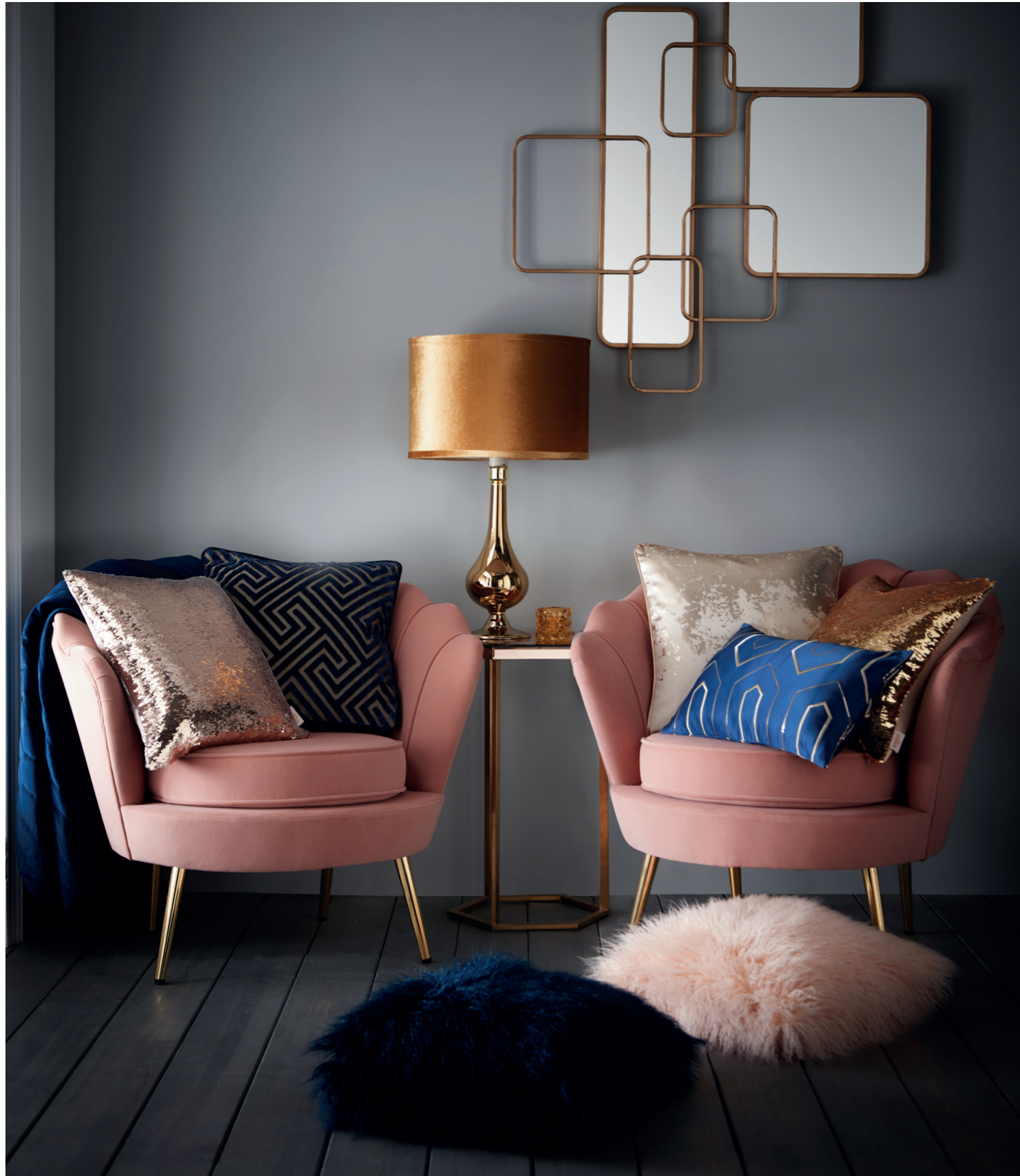
Above left to right: Geometric Velvet throw midnight, Sequin cushion rose gold, Greek Key cushion, Faux Mongolian cushion midnight & blush, Splatter Foil Print cushion, Phoebe Boudoir cushion midnight, Sequin cushion gold.