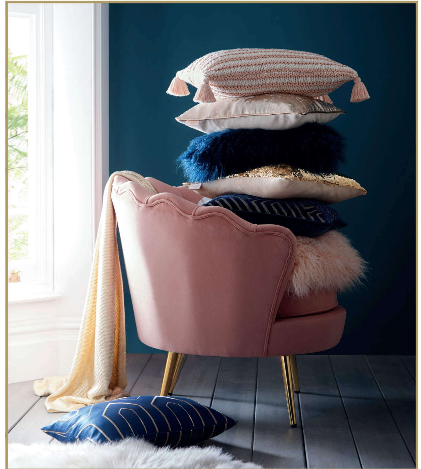
Above top to bottom: Knitted Stripe cushion, Splatter Foil Print cushion, Faux Mongolian cushion midnight, Sequin cushion gold, Greek Key cushion, Faux Mongolian cushion blush, Knit throw gold, Phoebe Boudoir cushion midnight.