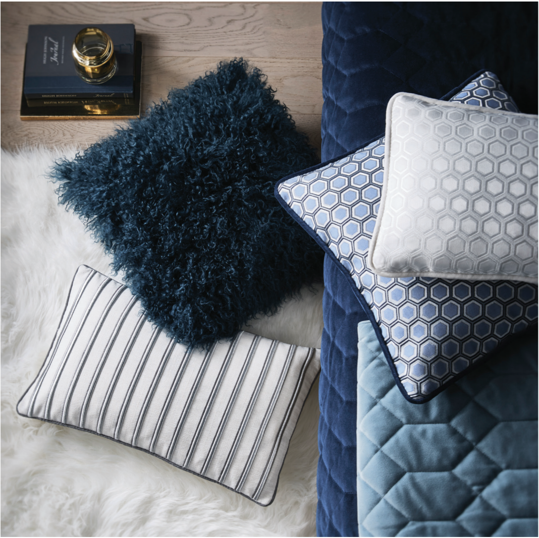
Above left to right: Faux Mongolian cushion midnight, Metallic Stripe boudoir, Geometric Velvet throw midnight & duckegg, Hexagon cushion navy, Hexagon boudoir cushion white.

Quartz bedlinen provides a contemporary update to your interior. For an extra touch of luxury, layer up with the Geometric velvet throw and accompanying Hexagon and Metallic Stripe cushions.