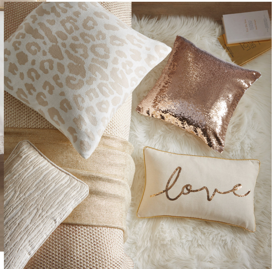
Above left to right: Diamond Knit cushion, Amber bedlinen, Faux Mongolian cushion blush, Sequin cushion rose gold, Shimmer Sequin cushion, Love boudoir cushion, Diamond Knit throw, Knit throw rose gold Left left to right: Knit Leopard cushion, Knit throw rose gold, Knit throw gold, Sequin cushion rose gold, Zebra boudoir cushion, Love boudoir cushion.