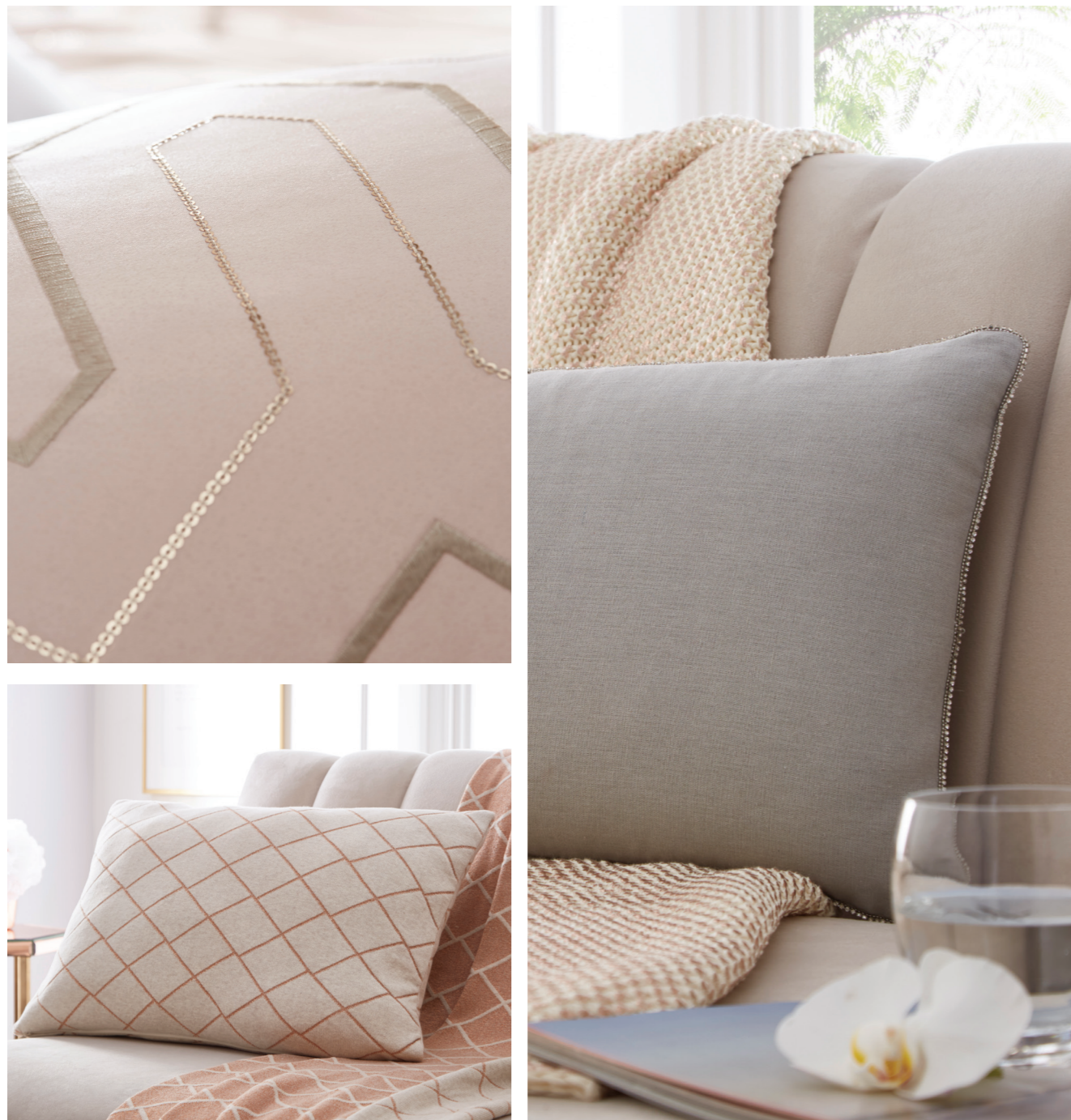
Cushions left to right: Diamond Knit cushion and throw, Diamante Trim boudoir cushion, Knit throw rose gold Right left to right: Bolster cushion mink, Phoebe bedlinen blush, Diamond Knit cushion, Phoebe boudoir cushion blush, Sequin cushion rose gold, Diamante Trim boudoir cushion, Faux Mongolian cushion blush, Knit throw rose gold, Diamond Knit throw.

Add a touch of 1920's glamour to your home. This lustrous blush embroidered design with intricate sequin detailing provides an art deco touch to your interior.