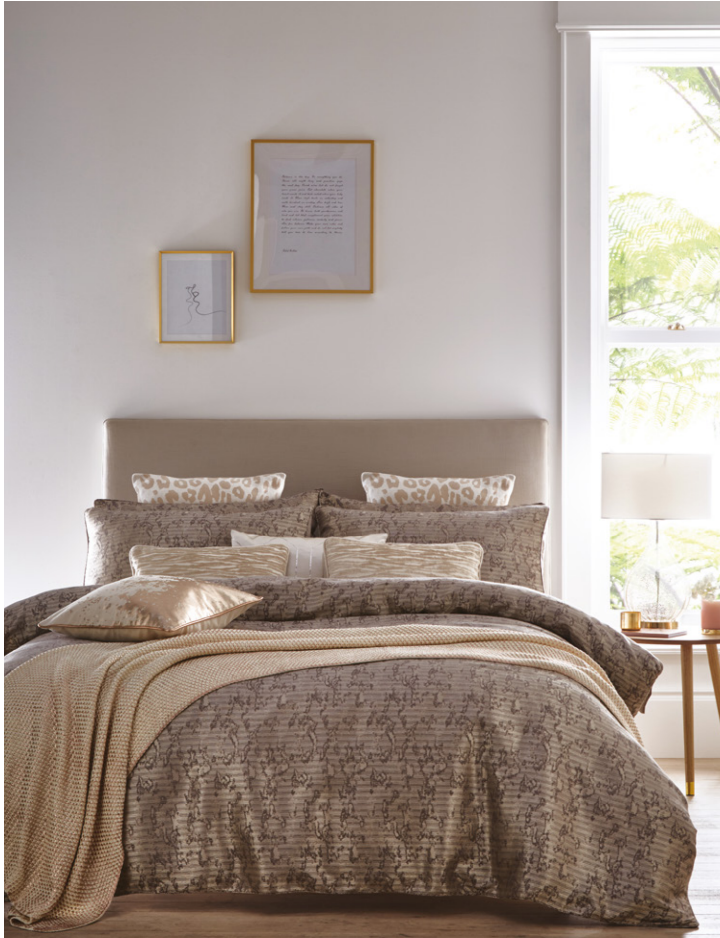
Above left to right: Knit Leopard cushion, Lux bedlinen, Phoebe boudoir cushion champagne, Splatter Foil print cushion, Knit throw rose gold.