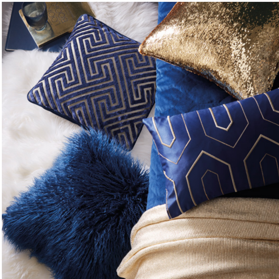
Above top to bottom: Sequin cushion gold, Geometric Velvet throw midnight, Phoebe Boudoir cushion midnight, Faux Mongolian cushion midnight, Knit throw gold.

Phoebe is reimagined in a decadent midnight colourway for an inspired art-deco look. The labyrinth pattern of gold embroidery works its way across this glamorous satin bedlinen, complete with sequin detailing. Add to the 1920s look with beautiful bolster cushions and coordinating Phoebe boudoir cushion in the same deep midnight colourway.