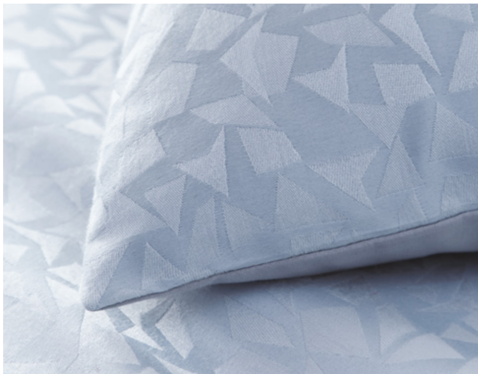
Above left to right: Topaz bedlinen silver, Venus cushion silver, Tessellate cushion, Opal cushion, Mercury cushion.