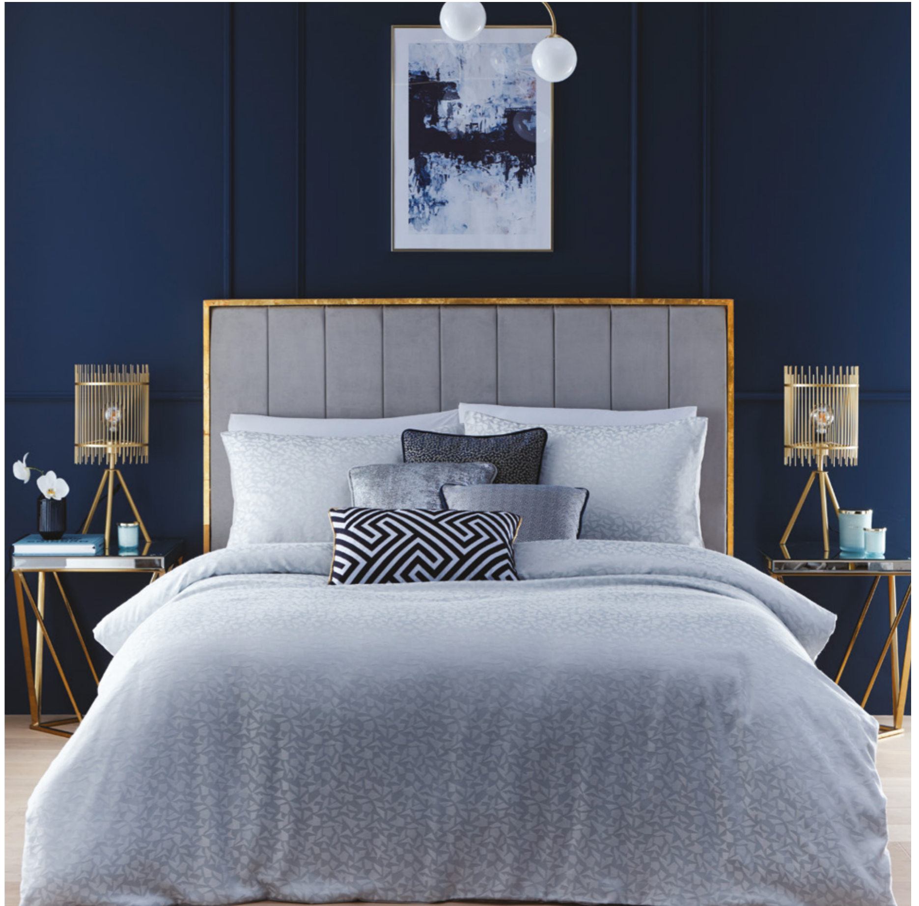
Above left to right: Topaz bedlinen silver, Tessellate cushion, Venus cushion silver, Opal cushion, Mercury cushion.