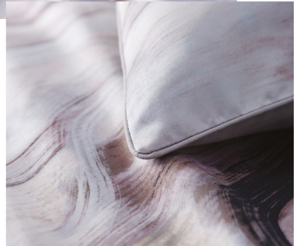
Left top to bottom: Galaxy bedlinen, Venus cushion silver, Saturn cushion.