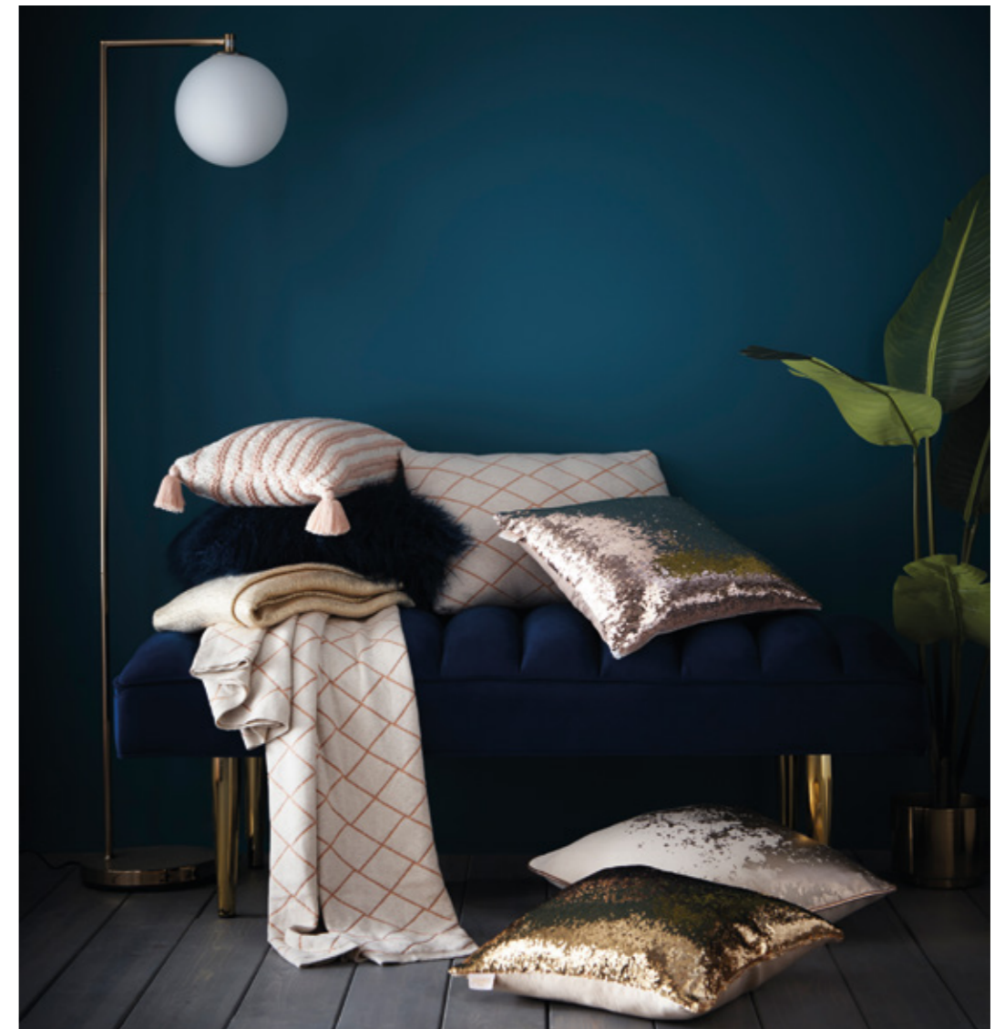
Left top to bottom: Amber pillowcases, Zebra bedlinen, Faux Mongolian cushion blush, Splatter Foil Print cushion, Sequin cushion rose gold, Knitted Stripe cushion, Knit throw gold Above top to bottom: Knitted Stripe cushion, Diamond Knit cushion, Faux Mongolian cushion midnight, Sequin cushion rose gold, Knit throw gold, Diamond Knit throw, Splatter Foil print cushion, Sequin cushion gold.

Add a touch of glamour to your bedroom with this sumptuous cotton jacquard. This fresh white bedlinen is finished with a sophisticated oxford edge. Style with the tasseled knitted stripe cushion and faux Mongolian cushion in blush for a cosy feel.