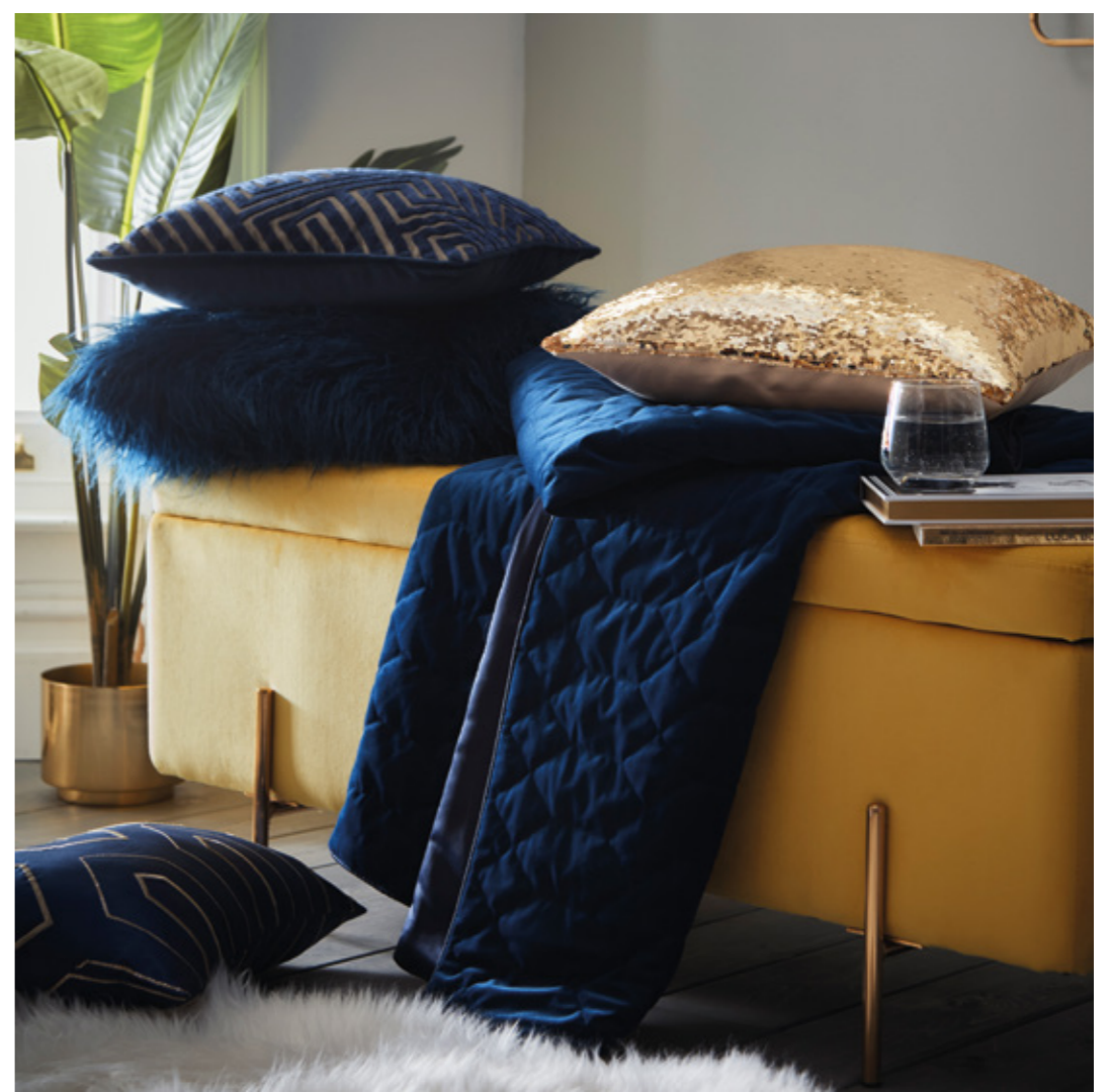
Left top to bottom: Topaz bedlinen midnight, Sequin cushion gold, Faux Mongolian cushion midnight, Knit throw gold Above top to bottom: Faux Mongolian cushion midnight, Sequin cushion gold, Geometric Velvet throw midnight, Phoebe cushion midnight.

A geometric jacquard comprised of intricate tessellated shapes. Topaz midnight adds a stylish edge to your bedroom.