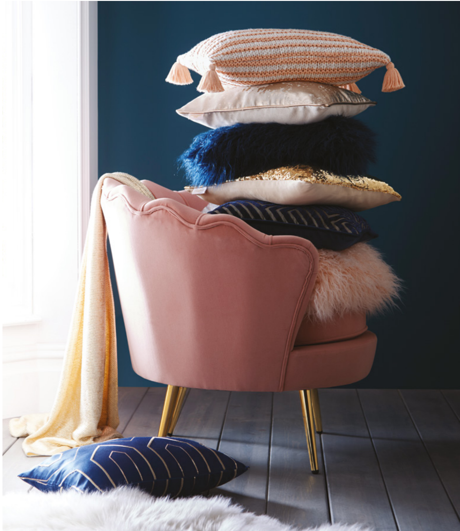
Above top to bottom: Knitted stripe cushion, Splatter foil print cushion, Faux Mongolian cushion midnight, Sequin cushion gold, Knit throw gold, Faux Mongolian cushion blush, Pheobe boudoir cushion midnight.