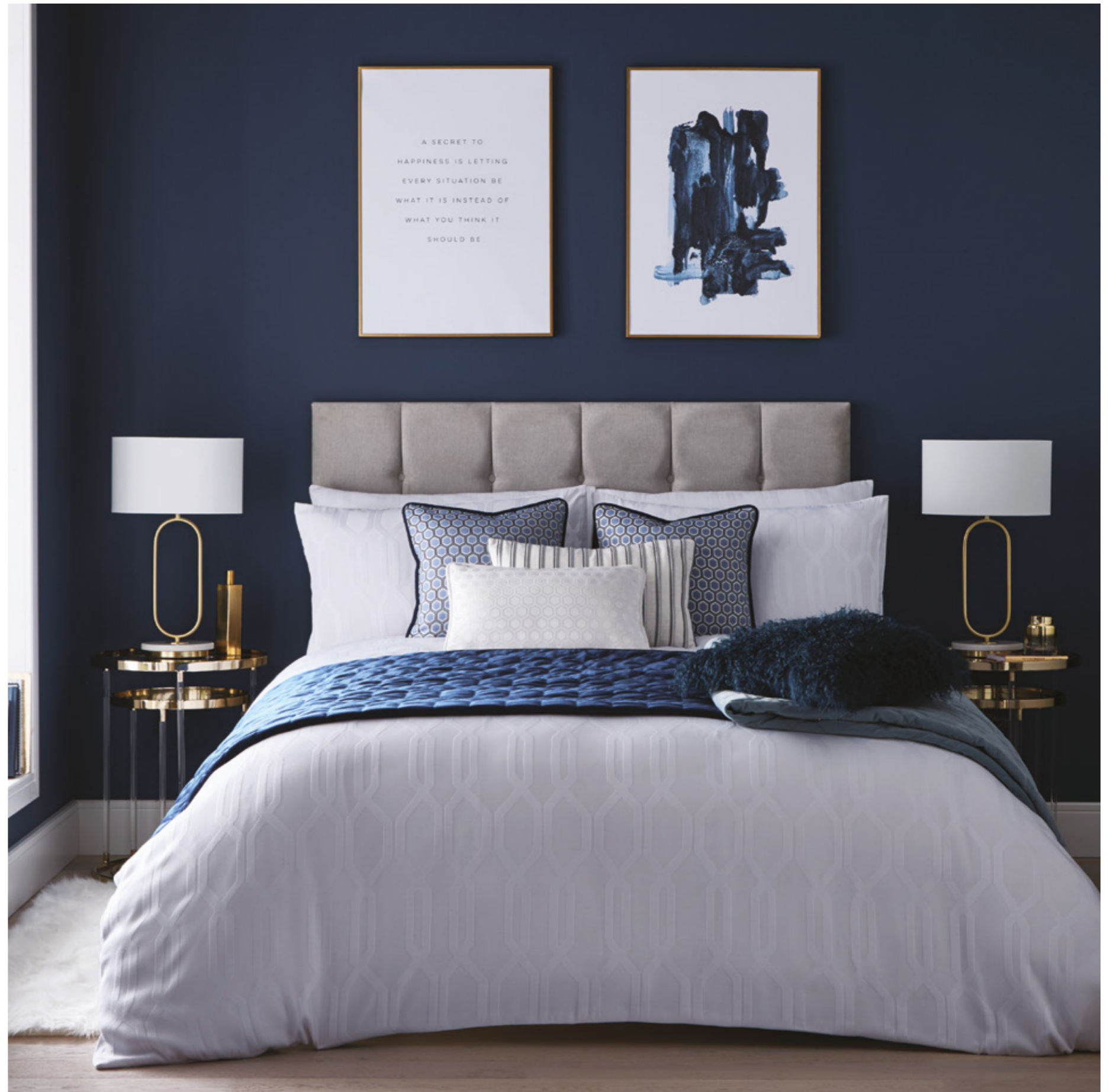
Above top to bottom: Quartz bedlinen, Hexagon cushion navy, Metallic Stripe boudoir, Hexagon boudoir cushion white, Geometric Velvet throw midnight and duckegg, Faux Mongolian cushion midnight.