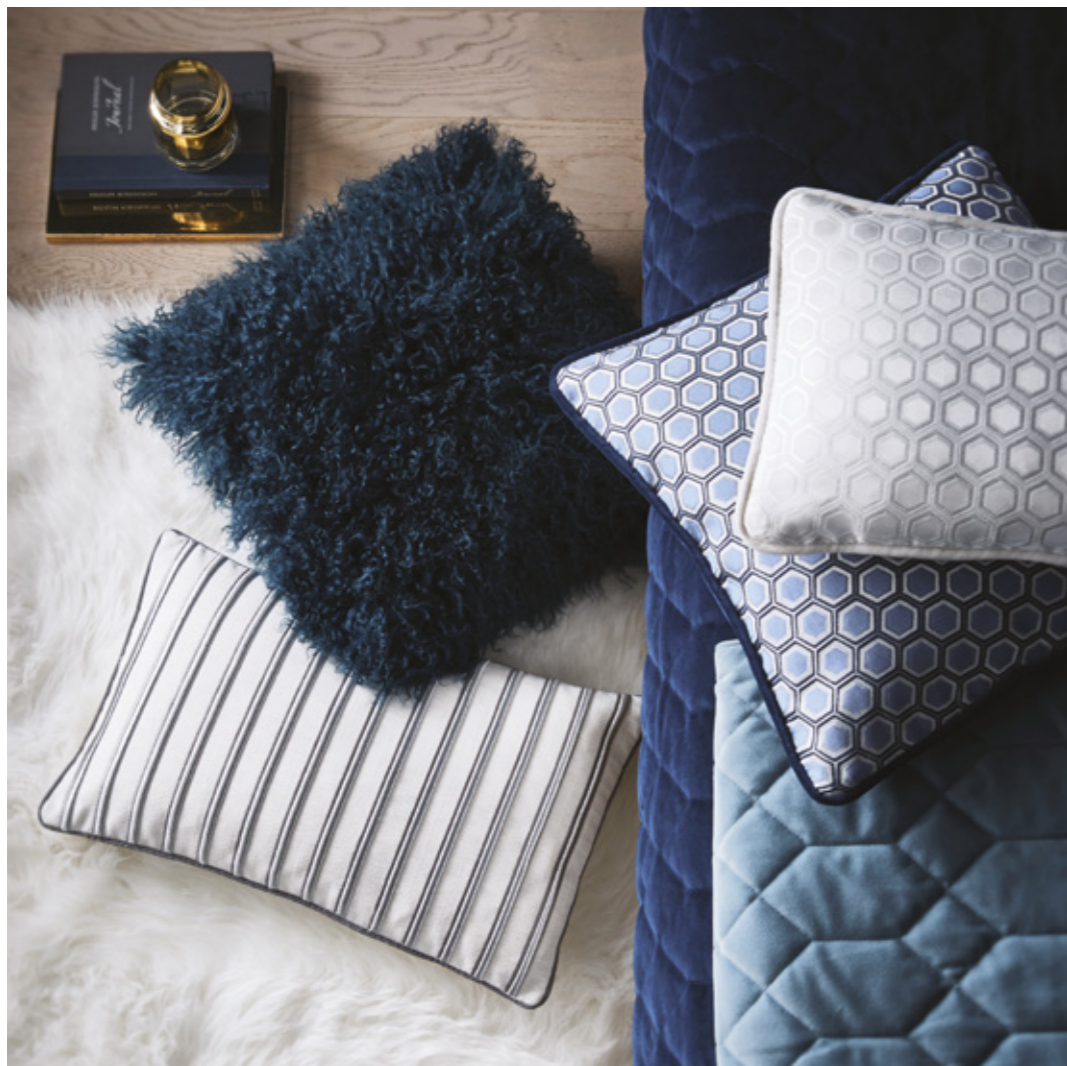
Above left to right: Faux Mongolian cushion midnight, Metallic Stripe boudoir, Geometric Velvet throw midnight & duckegg, Hexagon cushion navy, Hexagon boudoir cushion white.

Quartz bedlinen provides a contemporary update to your interior. For an extra touch of luxury, layer up with the Geometric velvet throw and accompanying Hexagon and Metallic Stripe cushions.