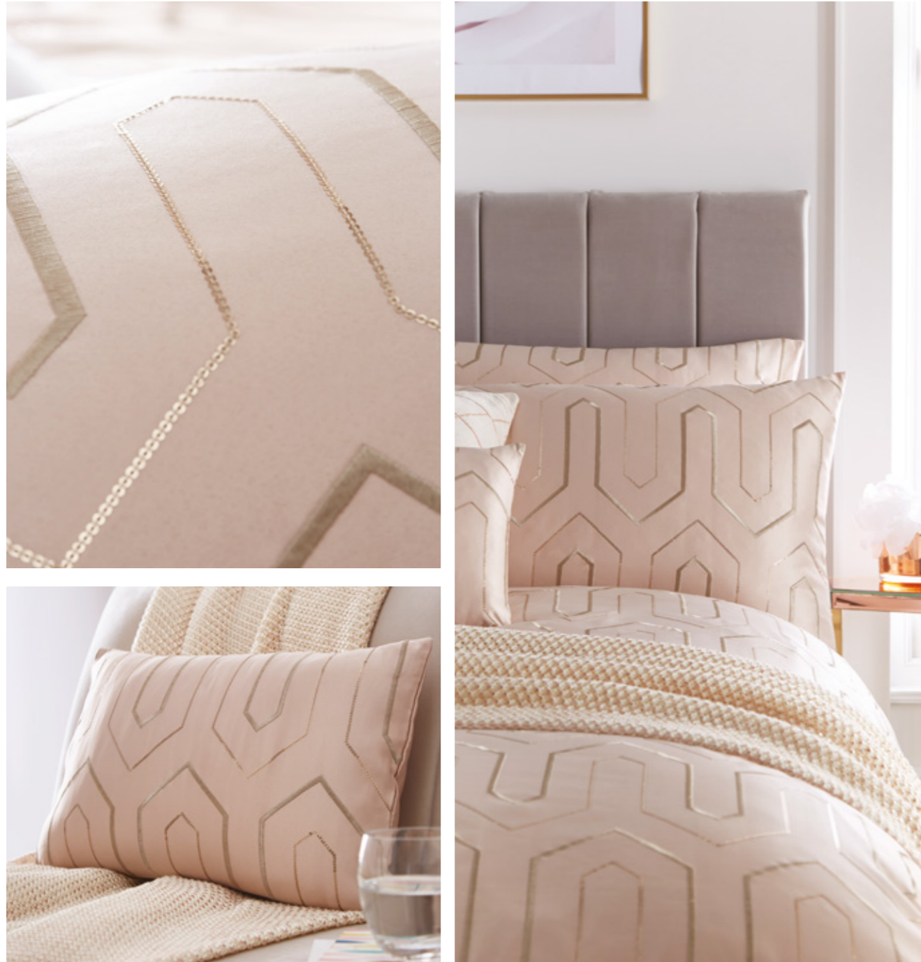
Above: Phoebe bedlinen blush, Phoebe boudoir cushion blush, Knit throw rose gold Right left to right: Bolster cushion, Phoebe bedlinen blush, Diamond Knit cushion, Phoebe boudoir cushion blush, Sequin cushion rose gold, Diamante Trim boudoir cushion, Faux Mongolian cushion blush, Knit throw rose gold, Diamond Knit throw.

Add a touch of 1920's glamour to your home. This lustrous blush embroidered design with intricate sequin detailing provides an art deco touch to your interior.