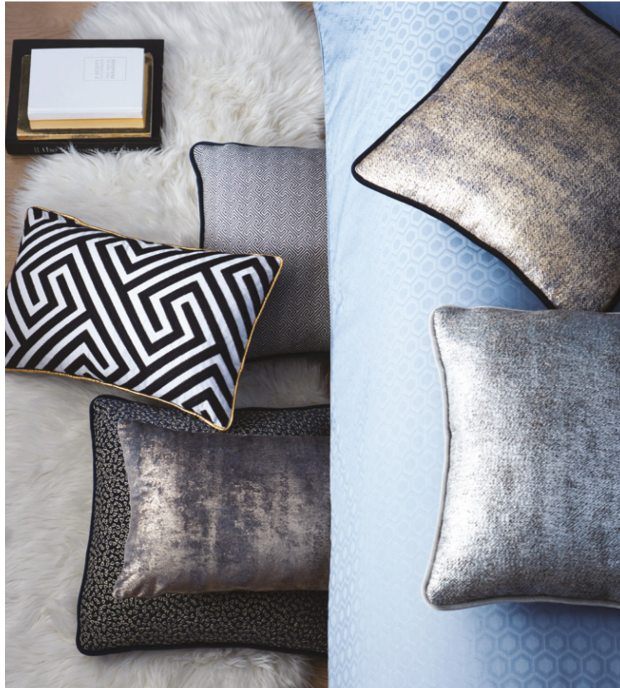
Above left to right: Tessellate cushion, Opal cushion, Saturn cushion, Mercury cushion, Hexagon bedlinen, Venus cushion midnight, Venus cushion silver. Right top to bottom: Venus cushions midnight, Hexagon bedlinen, Opal cushion, Tessellate cushion.

A restful night's sleep is guaranteed with the relaxing Twilight shade of Hexagon. Pair with the Venus midnight and Opal cushions for a subtle metallic shimmer or the striking Tessellate cushion, designed to create a statement.