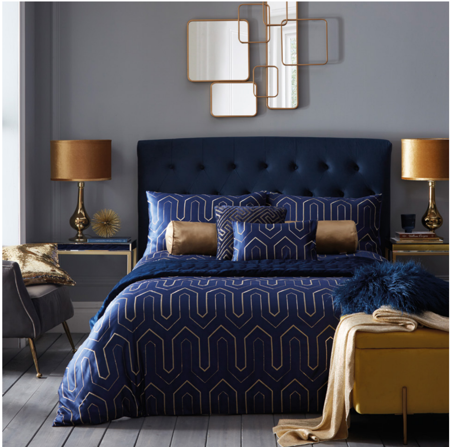
Above left to right: Sequin cushion gold, Phoebe bedlinen midnight, Geometric Velvet throw midnight, Bolster cushion, Phoebe Boudoir cushion midnight, Knit throw gold, Faux Mongolian cushion midnight.