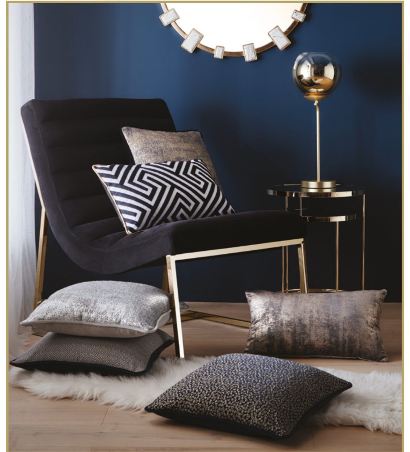
Above top to bottom: Venus cushion midnight, Tessellate cushion, Venus cushion silver, Saturn cushion, Mercury cushion, Opal cushion.