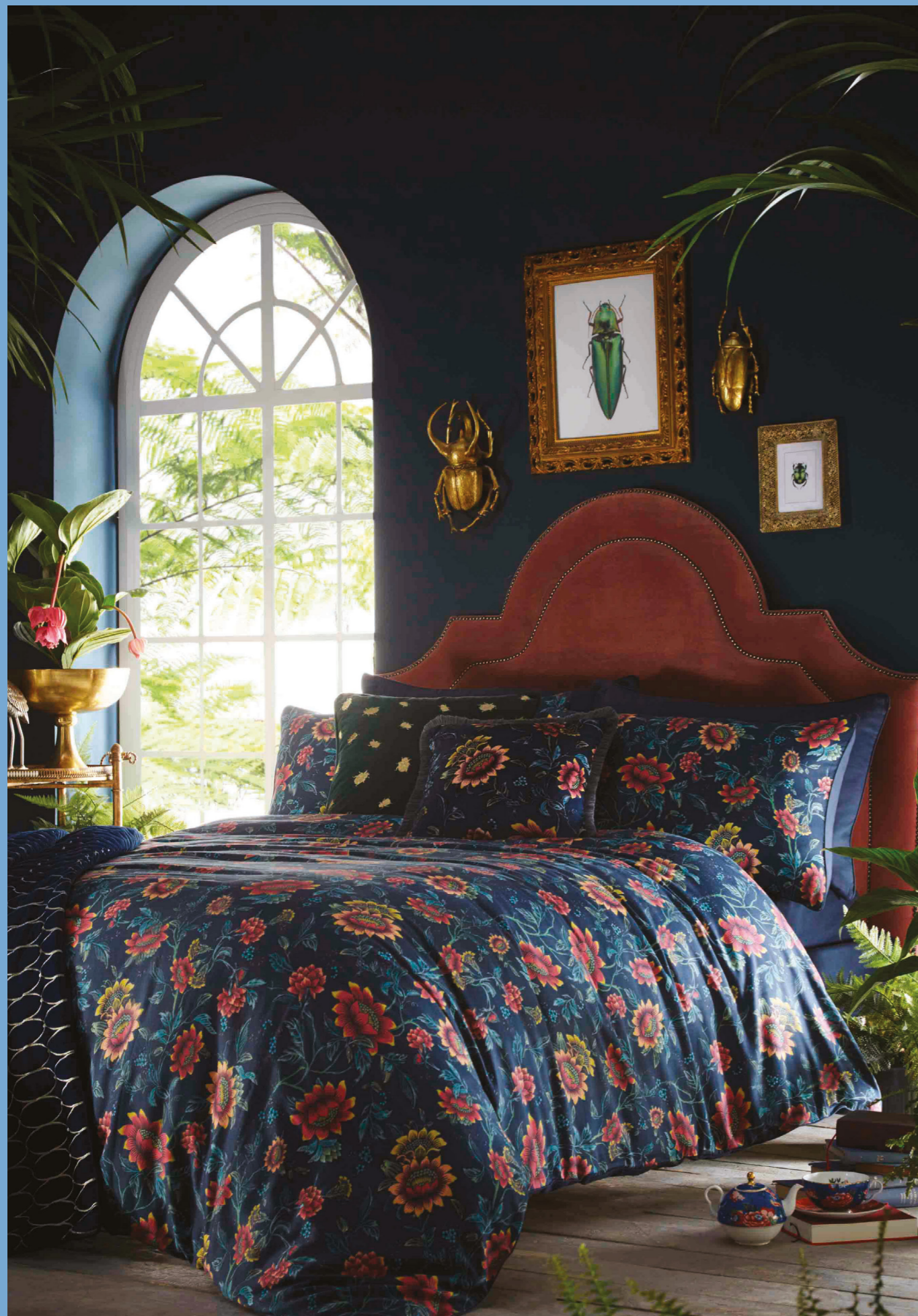
Left to right Throw: Renaissance Midnight Bedlinen: Tonquin Midnight Cushions: Firefly Emerald, Tonquin Midnight Ceramics: Paeonia Blush Tea for one