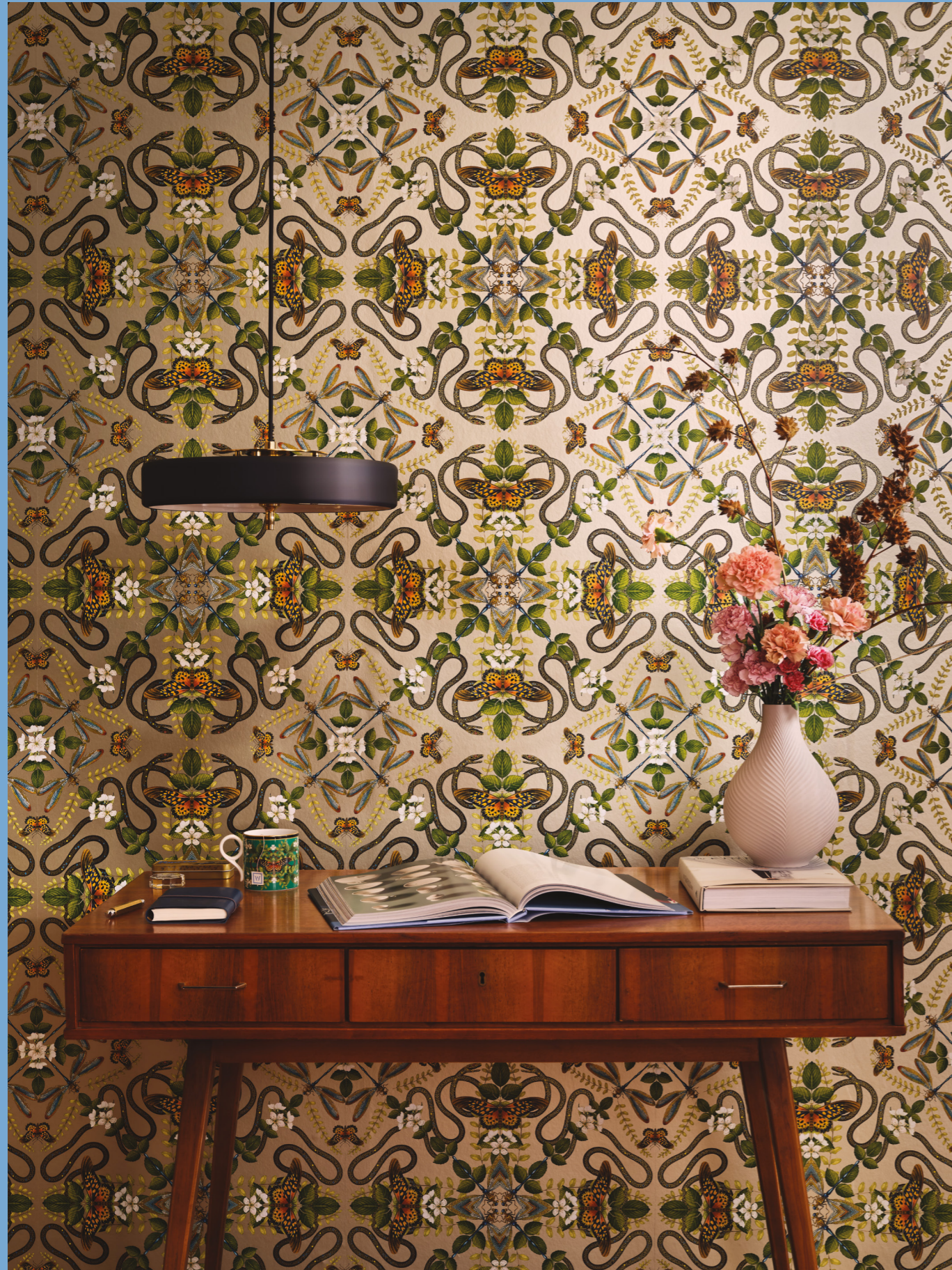
Wallcovering: Emerald Forest Gilver Ceramics: Wonderlust Emerald Forest Mug, Jasper Folia Powder Pink Bulb Vase

Step into Emerald Forest's fantastical wonderland and lose yourself amongst lush, abundant foliage. Packed full of flora and fauna, this verdant pattern is reminiscent of a whimsical walk amongst ancient English woodland.