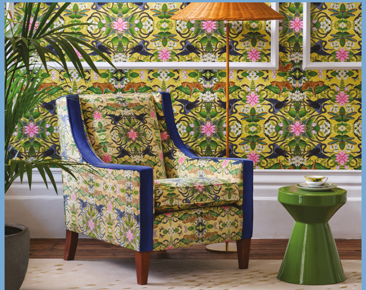
(Top left) Bedlinen: Wonderlust Tea Story Blush Cushion: Wonderlust Tea Story Citron (Top right) Sofa: Emerald Forest Teal Velvet Fabric Cushions: Alvar Candy Fabric, Menagerie Midnight (Bottom) Armchair: Wonderlust Tea Story Citron Velvet Fabric Wallcovering: Wonderlust Tea Story Citron Ceramics: Wonderlust Waterlily Teacup & Saucer, Waterlily Side Plate