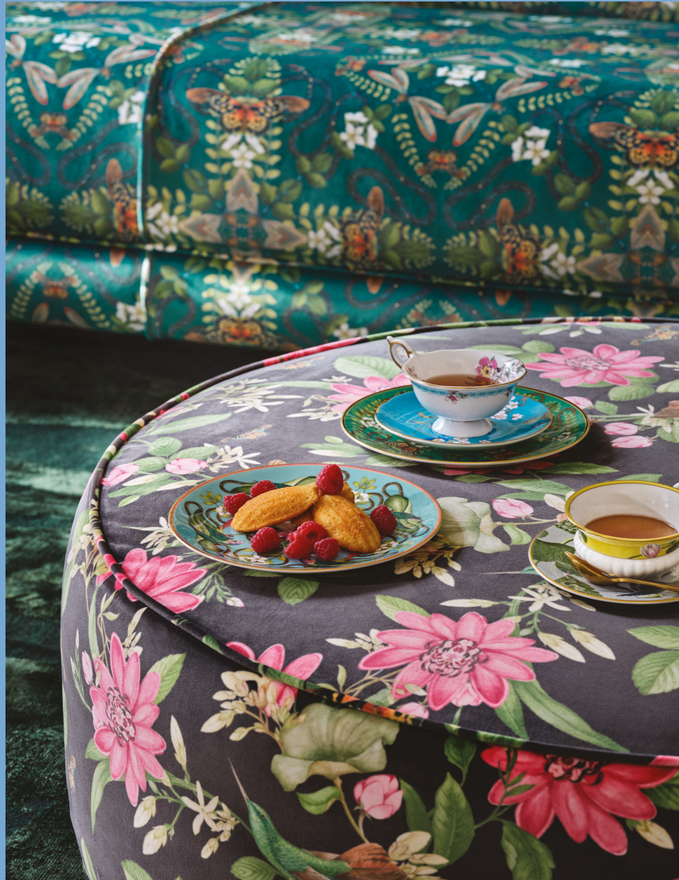
Sofa: Emerald Forest Teal Velvet Fabric Drum: Pink Lotus Noir Velvet Fabric Ceramics left to right: Wonderlust Menagerie Plate, Wonderlust Emerald Forest Plate, Wonderlust Apple Blossom Teacup & Saucer, Wonderlust Waterlily Teacup & Saucer

A symbol of inner wisdom and the sanctity of daily life, the Pink Lotus is considered a sacred flower in the tropics of Asia. Typically found in marshy swamps, it produces gigantic fragrant blossoms and leaves, a haven for flying insects such as bejewelled dragonflies. The delicate balance of daily life is celebrated in this bold and beautiful pattern.