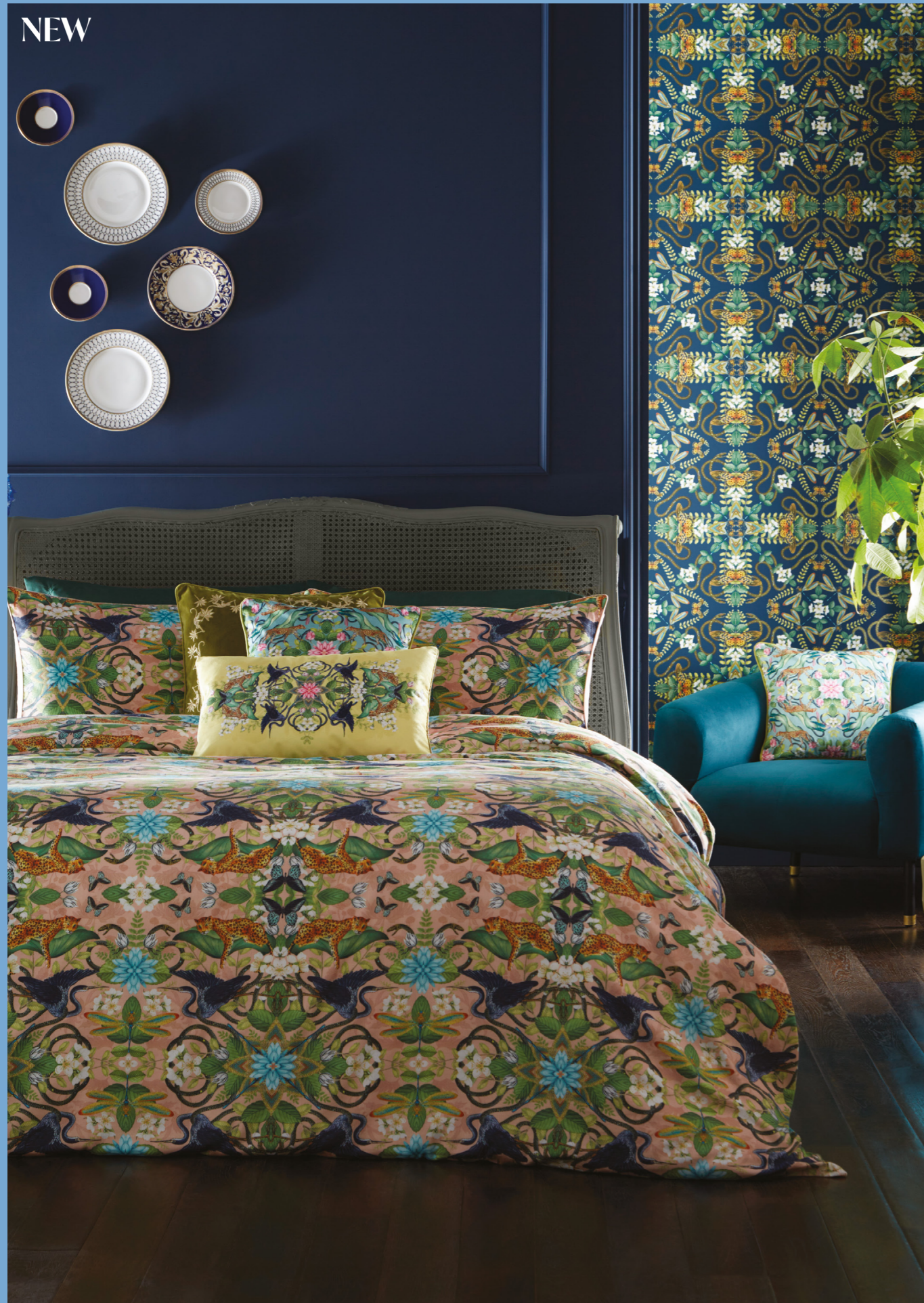
Bedlinen: Wonderlust Tea Story Blush Cushions front to back: Wonderlust Tea Story Citron, Menagerie Aqua, Sapphire Garden Olive Ceramics left to right: Wonderlust Sapphire Garden Mug, Renaissance Gold Saucer, Renaissance Gold Dinner Plate, Renaissance Gold Side Plate, Florentine Accent