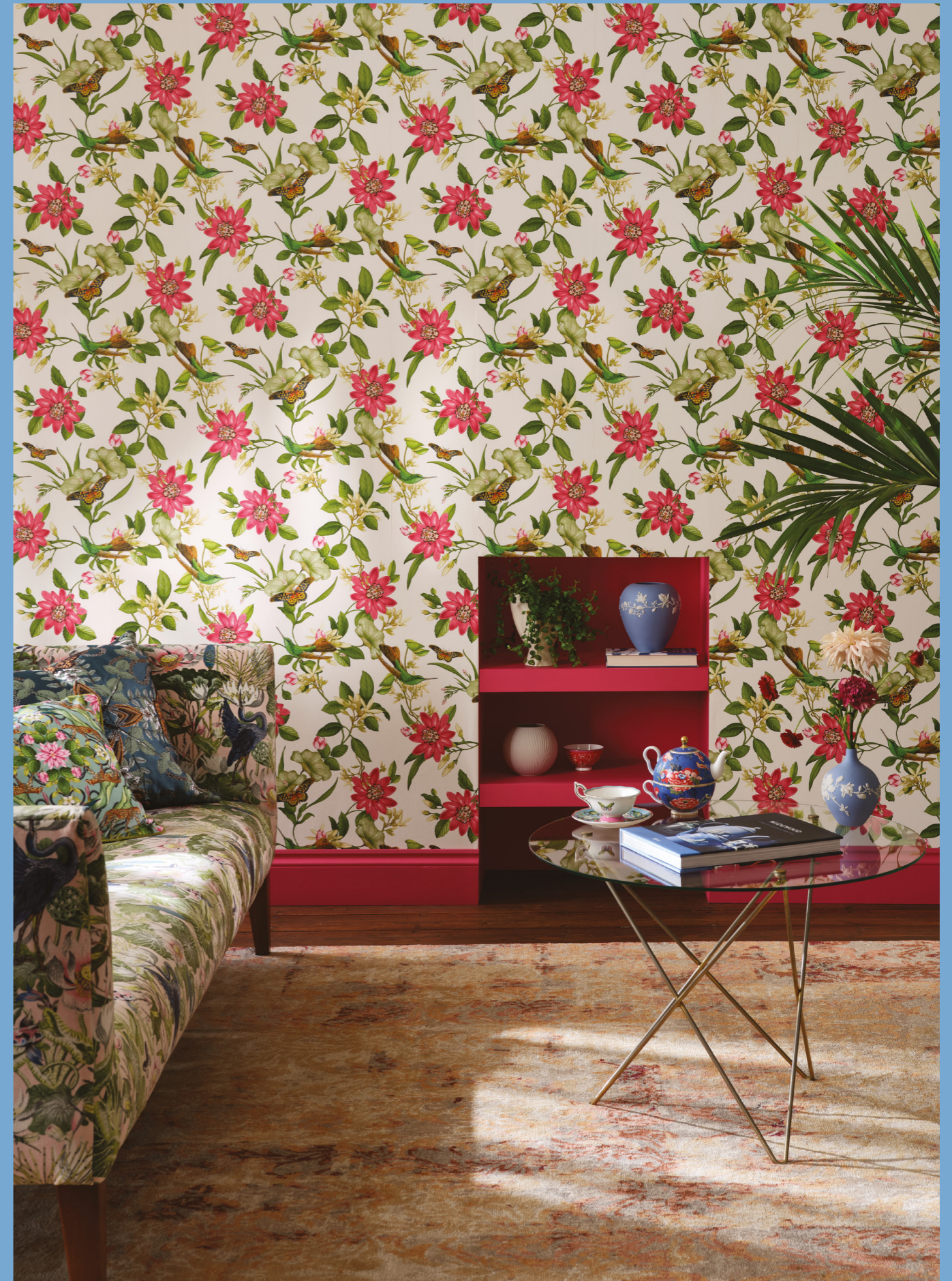
Wallcovering: Pink Lotus Ivory Sofa: Waterlily Blush Velvet Fabric Cushions left to right: Menagerie Aqua, Emerald Forest Teal Jacquard Fabric Ceramics left to right: Jasper Folia Warm White Rose Bowl, Wonderlust Crimson Jewel Bowl, Wonderlust Menagerie Teacup & Saucer, Magnolia Blossom Large Jasper Vase, Paeonia Blush Tea for one, Magnolia Blossom Jasper Bud Vase (Back page) Cushions left to right: Tonquin Noir, Sapphire Garden Seagrass, Waterlily Midnight Ceramics left to right: Renaissance Gold Side Plate, Renaissance Gold Side Plate Florentine Accent, Renaissance Gold Dinner Plate, Renaissance Gold Saucer, Renaissance Gold Teacup & Saucer