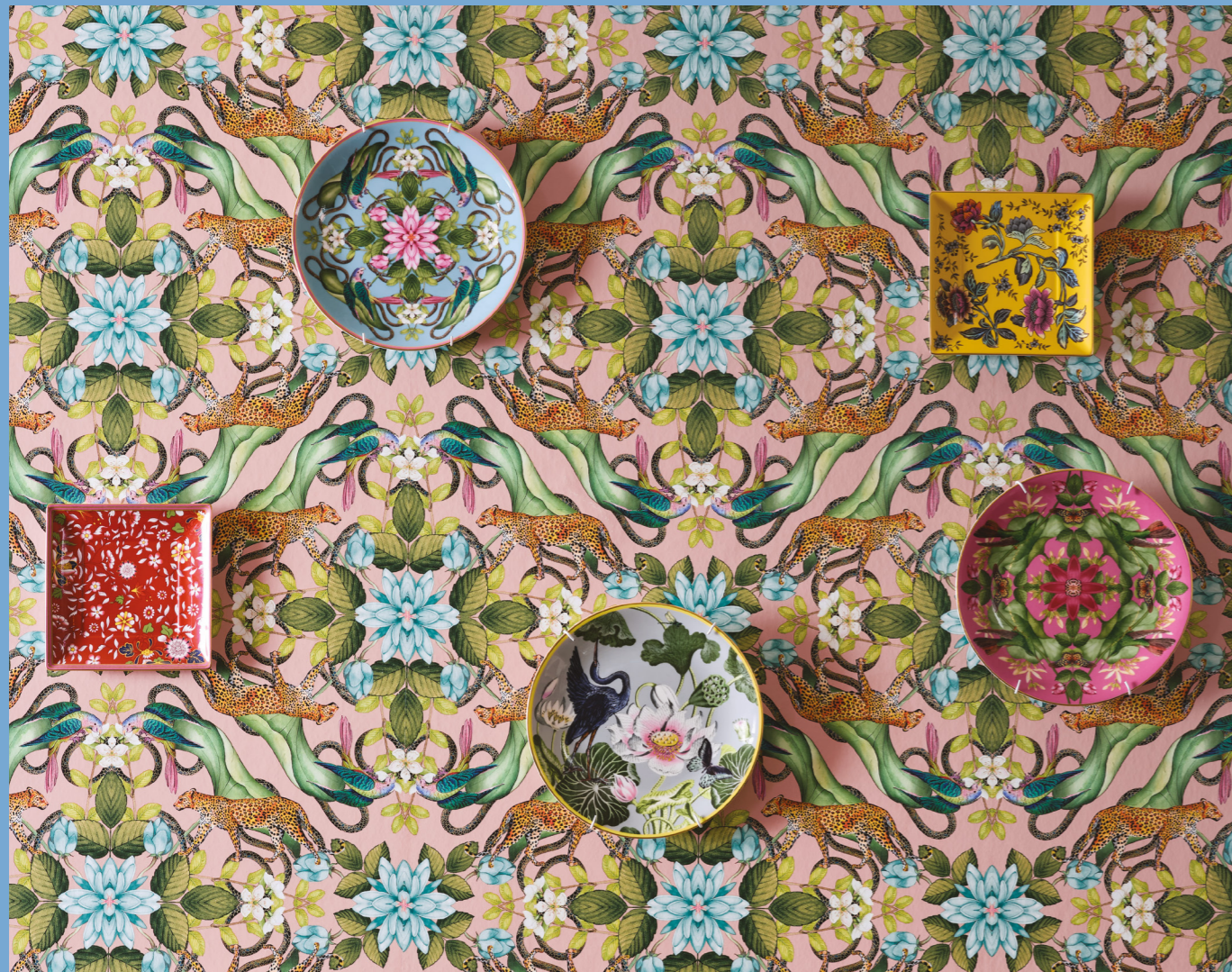
(Top left) Bedlinen: Magnolia Wedgwood Jasper Cushion: Menagerie Aqua (Top right) Wallcovering: Tonquin Midnight Armchair: Menagerie Aqua Fabric Cushion: Wonderlust Tea Story Teal Velvet Fabric (Bottom) Wallcovering: Menagerie Blush Ceramics left to right: Wonderlust Crimson Jewel Tray, Wonderlust Menagerie Plate, Wonderlust Waterlily Plate, Wonderlust Yellow Tonquin Tray, Wonderlust Pink Lotus Plate