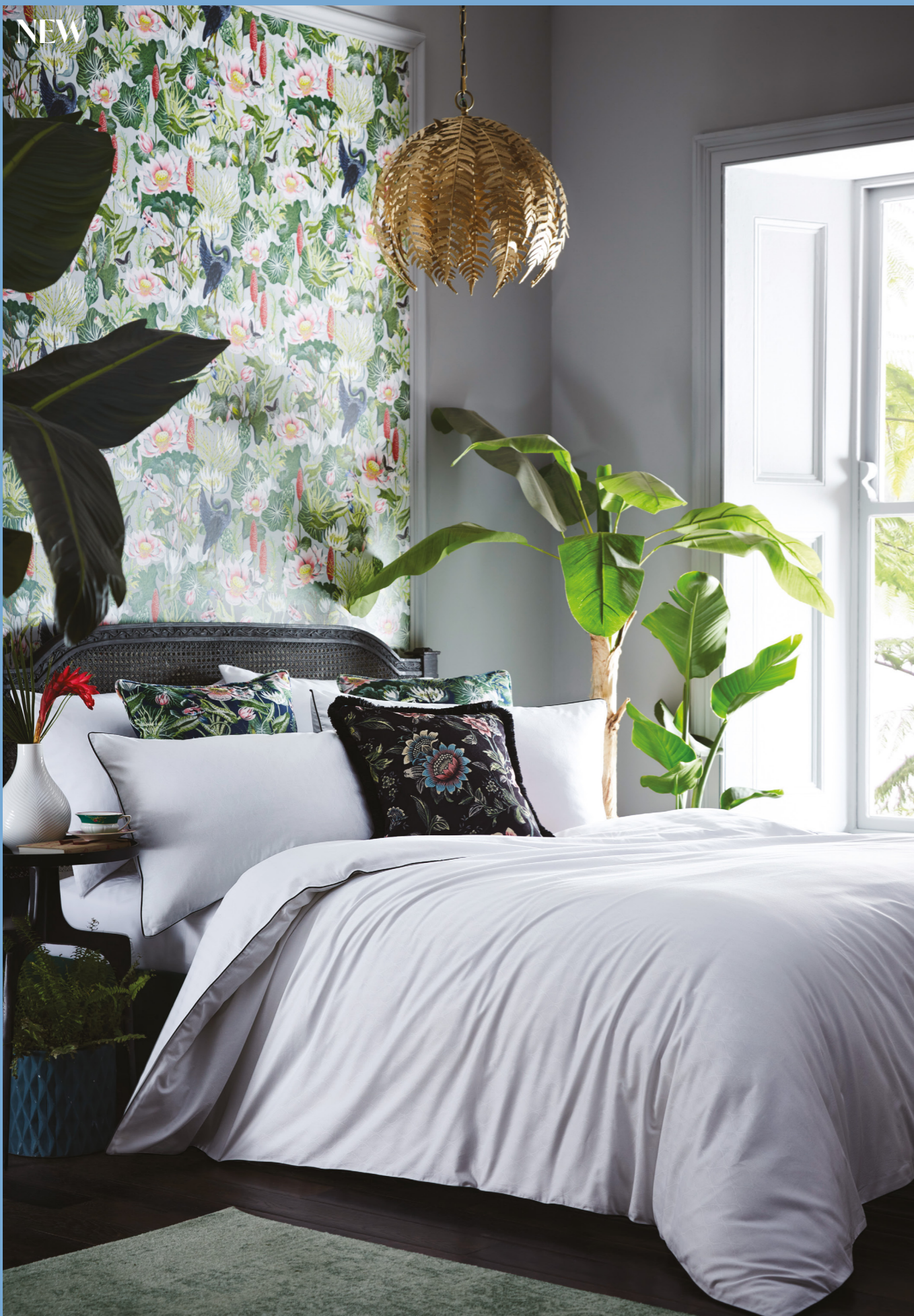
NEW Wallcovering: Waterlily Dove Bedlinen: Folia White Cushions front to back: Tonquin Noir, Waterlily Midnight Ceramics left to right: White Folia Bulb Vase, Wonderlust Pink Lotus Teacup & Saucer