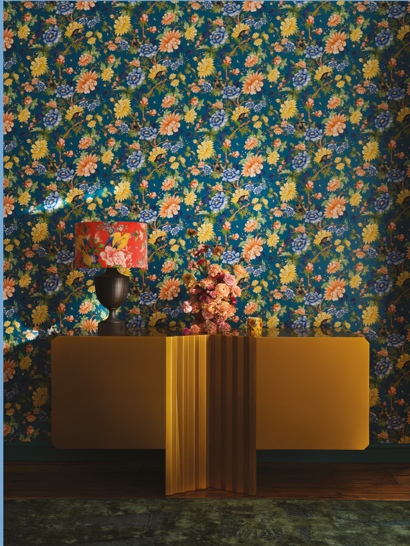
Wallcovering: Sapphire Garden Sapphire Lampshade: Golden Parrot Coral Velvet Fabric Ceramics: Wonderlust Yellow Tonquin Candle

Take a voyage of discovery through our Sapphire Garden and make friends with native Rhesus Macaques. Inspired by the Grand Tour from Europe through Asia, this fabric is heavily influenced by Wedgwood's archival patterns. Featuring temple-dwelling monkeys, Indian decorative designs and exotic colours, it will take your interior on a grand tour of its own.