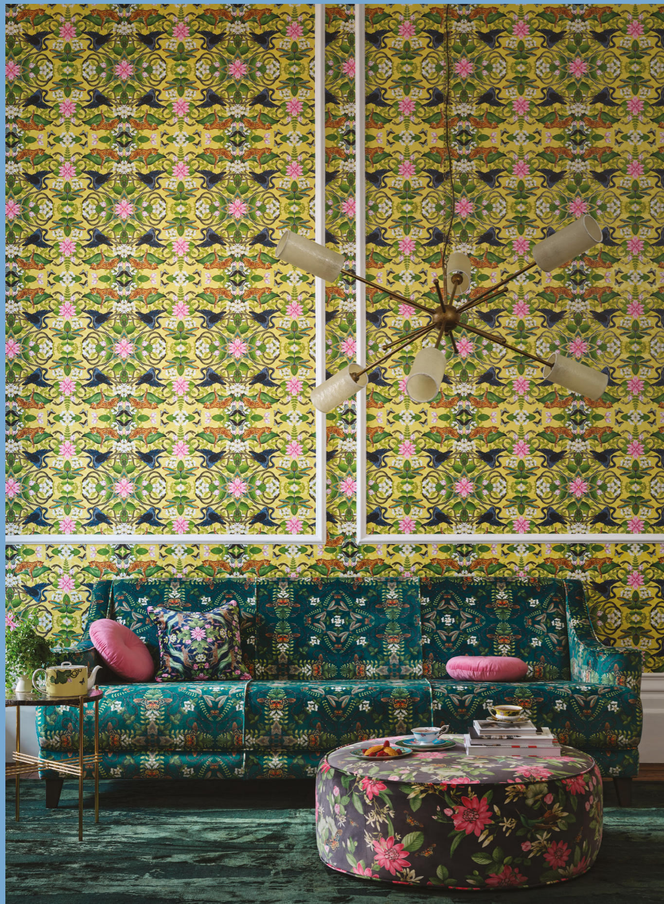
Cushions front to back: Wonderlust Tea Story Citron, Menagerie Aqua, Sapphire Garden Olive Ceramics left to right: Wonderlust Sapphire Garden Mug, Renaissance Gold Saucer, Renaissance Gold Dinner Plate, Renaissance Gold Side Plate Florentine Accent, Renaissance Gold Side Plate (Above) Wallcovering: Wonderlust Tea Story Citron Sofa: Emerald Forest Teal Velvet Fabric Cushions: Alvar Candy Fabric, Menagerie Midnight Drum: Pink Lotus Noir Velvet Fabric Ceramics: Waterlily Teapot, Wonderlust Menagerie Plate, Wonderlust Apple Blossom Teacup & Saucer, Wonderlust Emerald Forest Plate, Wonderlust Waterlily Teacup & Saucer