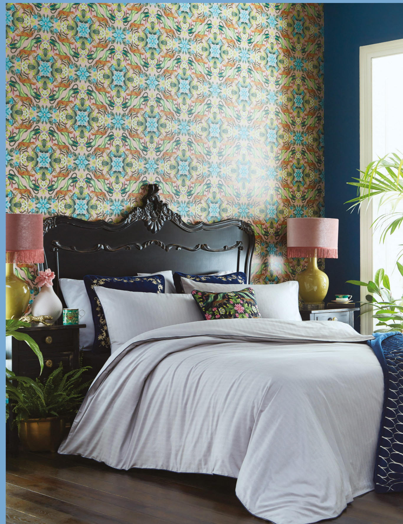
Wallcovering: Menagerie Blush Ceramics left to right: Jasper Folia Powder Pink Bulb Vase, Wonderlust Emerald Forest Mug, Wonderlust Pink Lotus Teacup & Saucer Bedlinen: Folia Smoke Cushions front to back: Menagerie Midnight, Sapphire Garden Midnight Throw: Renaissance Midnight

Nature can be good for the soul and for a restful night's sleep. Fresh air and lush foliage are the inspiration for this calming bedlinen set, that's woven from 100% cotton. Available in a choice of two colourways and both framed by contrasting piping, the natural design of blooming flowers and verdant leaves create a relaxing simplicity.