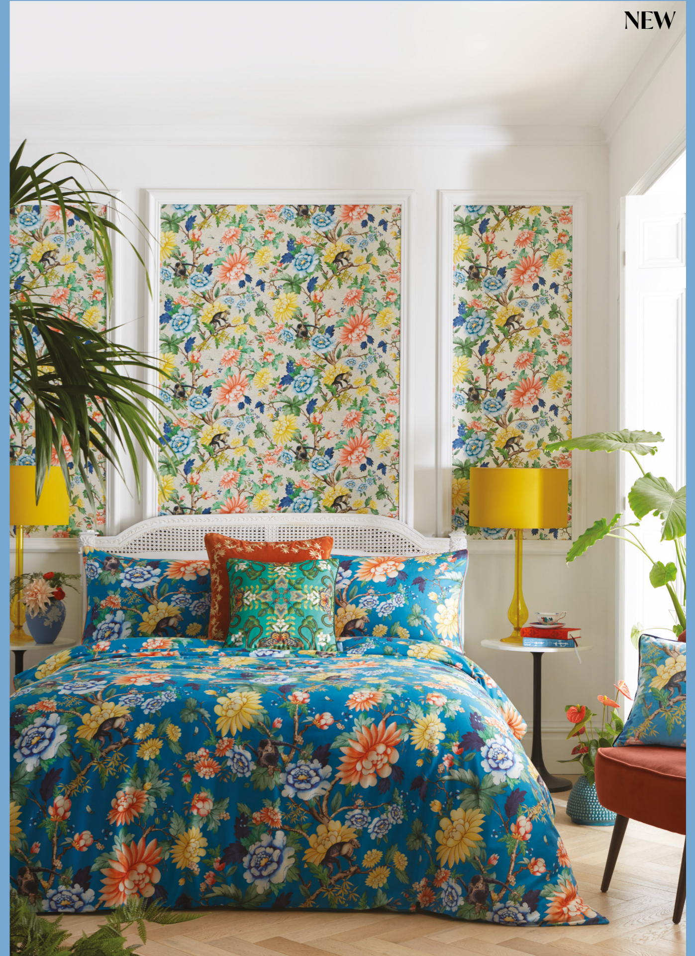
Bedlinen: Sapphire Garden Sapphire Cushions front to back: Sapphire Garden Sapphire, Emerald Forest Emerald, Sapphire Garden Spice Ceramics left to right: Magnolia Blossom Large Jasper Vase, Wonderlust Golden Parrot Teacup & Saucer Wallcovering: Sapphire Garden Ivory