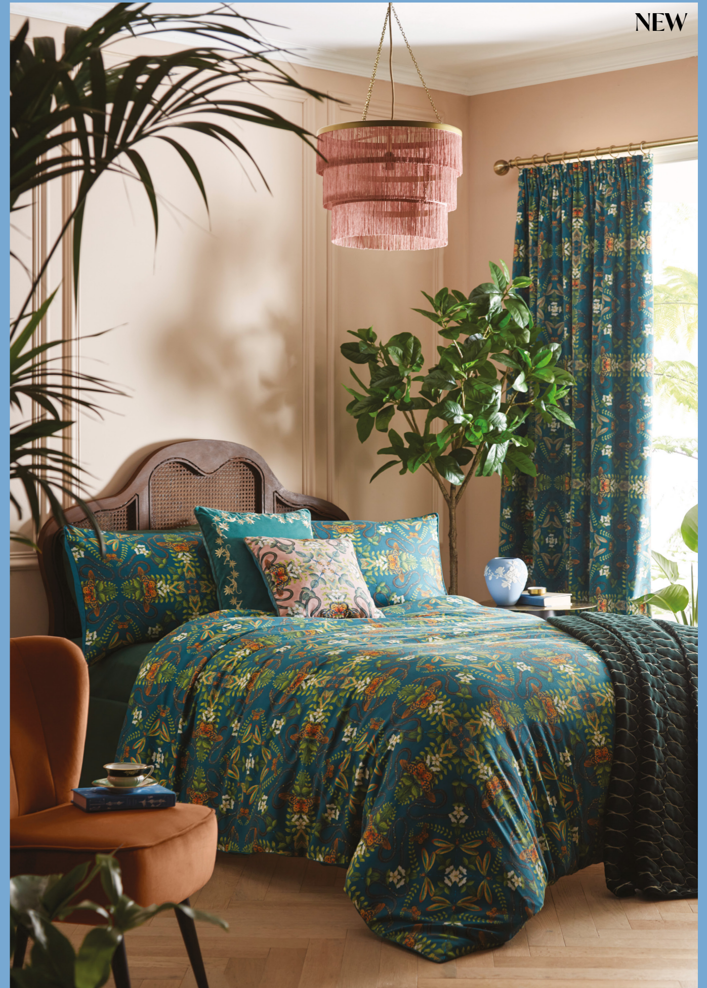
Bedlinen: Emerald Forest Teal Cushions front to back: Emerald Forest Blush, Sapphire Garden Seagrass Ceramics left to right: Wonderlust Emerald Forest Teacup & Saucer, Magnolia Blossom Large Jasper Vase