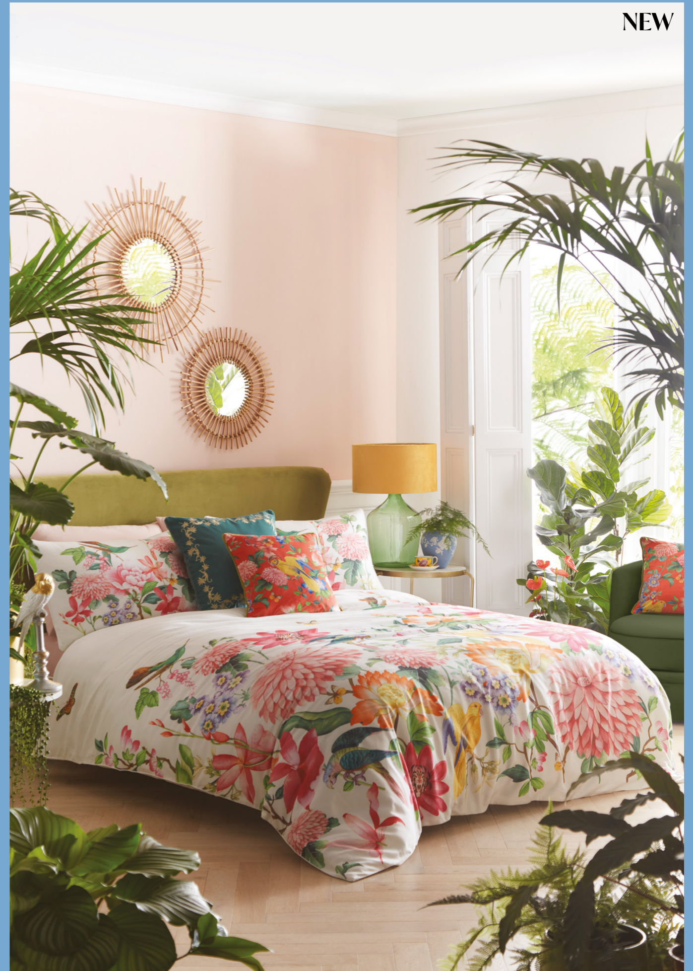
Bedlinen: Golden Parrot Ivory Cushions front to back: Golden Parrot Coral, Sapphire Garden Seagrass Ceramics left to right: Wonderlust Yellow Tonquin Teacup & Saucer, Magnolia Blossom Large Jasper Vase