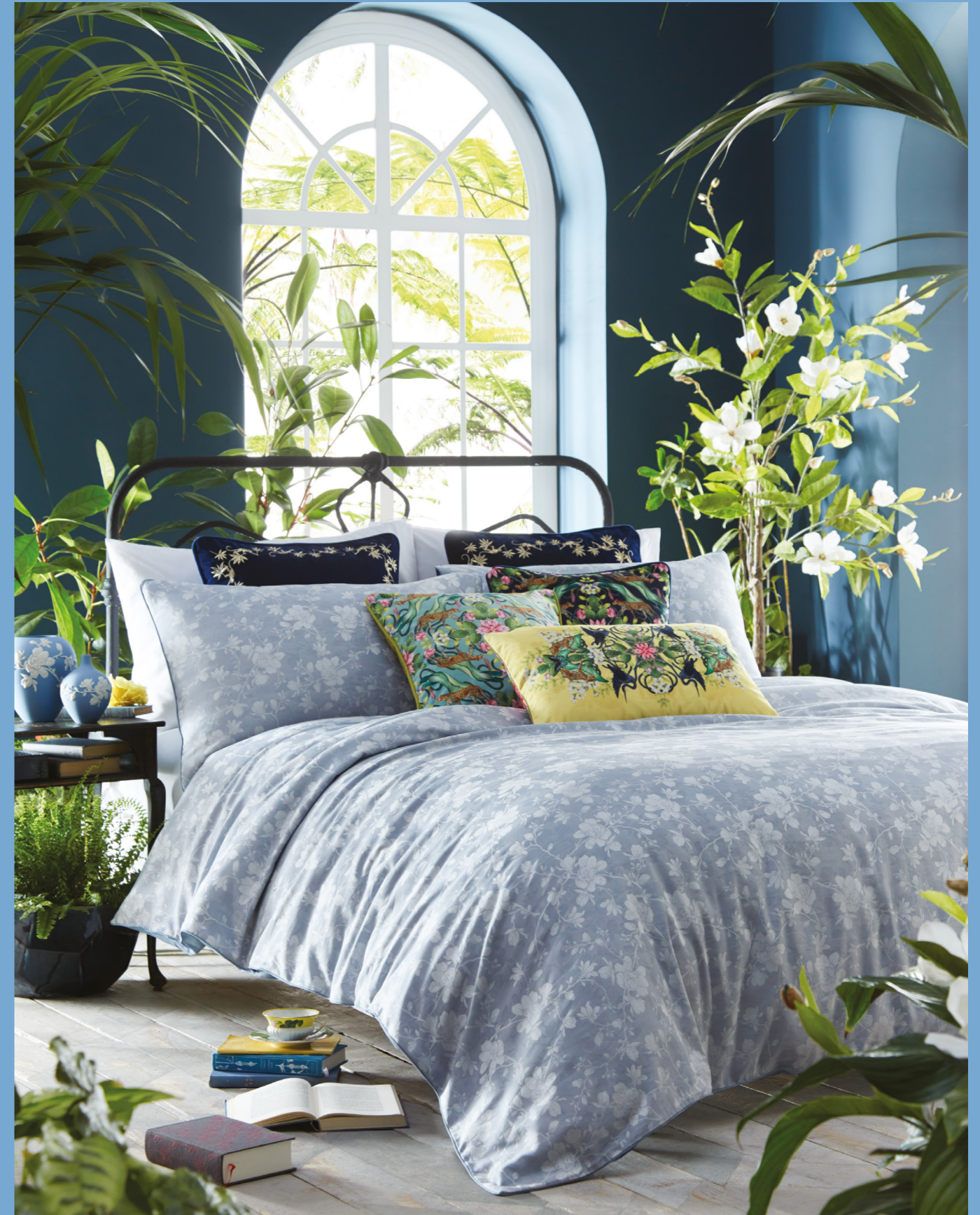
Ceramics top to bottom: Magnolia Blossom Large Jasper Vase, Magnolia Blossom Jasper Bud Vase, Wonderlust Waterlily Teacup & Saucer Bedlinen: Magnolia Wedgwood Jasper Cushions front to back: Wonderlust Tea Story Citron, Menagerie Aqua, Midnight, Sapphire Garden Midnight

Nothing says Wedgwood like blue and white Jasperware. With its quintessentially English colour palette, this duvet set is woven in 100% cotton and encased by a delicate cord piping. A new take on an iconic design, our interpretation includes two matching pillowcases that showcase the same exquisitely sculpted magnolia tree petals as the duvet cover. Available in double, king and super king sizes.