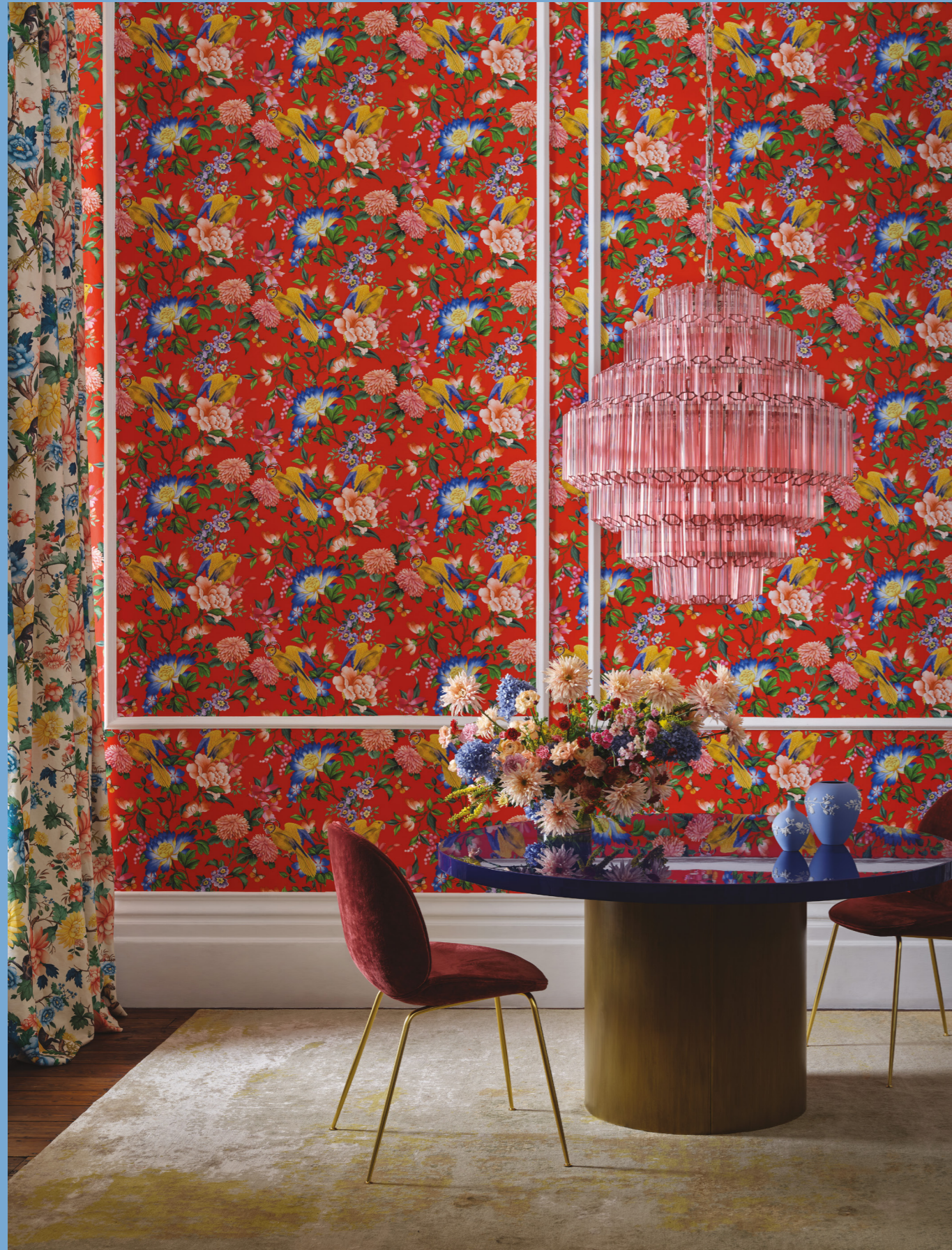
Drape: Sapphire Garden Ivory Fabric Wallcovering: Golden Parrot Coral Ceramics: Magnolia Blossom Large Jasper Vase, Magnolia Blossom Jasper Bud Vase

A Brazilian native, the Golden Parrot can only be found in a small area south of the Amazon River. Despite its striking yellow colour, this beautiful bird is difficult to spot in the wild. Set against a background of bright foliage, the Golden Parrot sits proudly amongst this striking pattern.