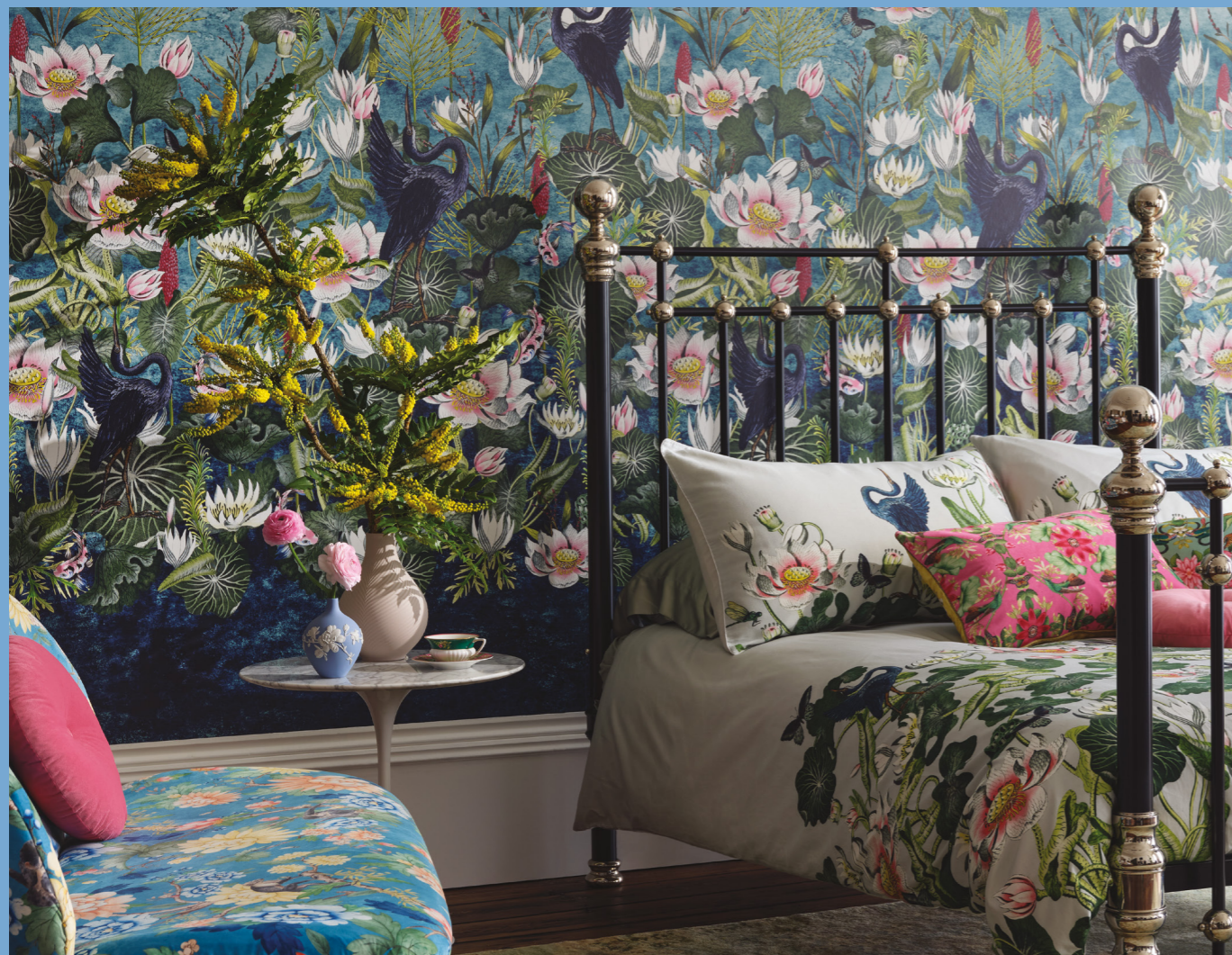
(Top left) Ceramics: Wild Strawberry Teacup & Saucer Peony and White Folia Rose Bowl Wallcovering: Waterlily Dove Sofa: Waterlily Blush Velvet Fabric Cushions left to right: Wild Strawberry Noir, Menagerie Midnight (Top right) Bedlinen: Waterlily Dove Ceramics: Magnolia Blossom Large Jasper Vase (Bottom) Wallcovering: Waterlily Marine Banner Chair: Sapphire Garden Sapphire Velvet Fabric Bedlinen: Waterlily Dove Cushions left to right: Wonderlust Tea Story, Menagerie Aqua Ceramics: Magnolia Blossom Jasper Bud Vase, Jasper Folia Powder Pink Bulb Vase, Wonderlust Pink Lotus Teacup & Saucer