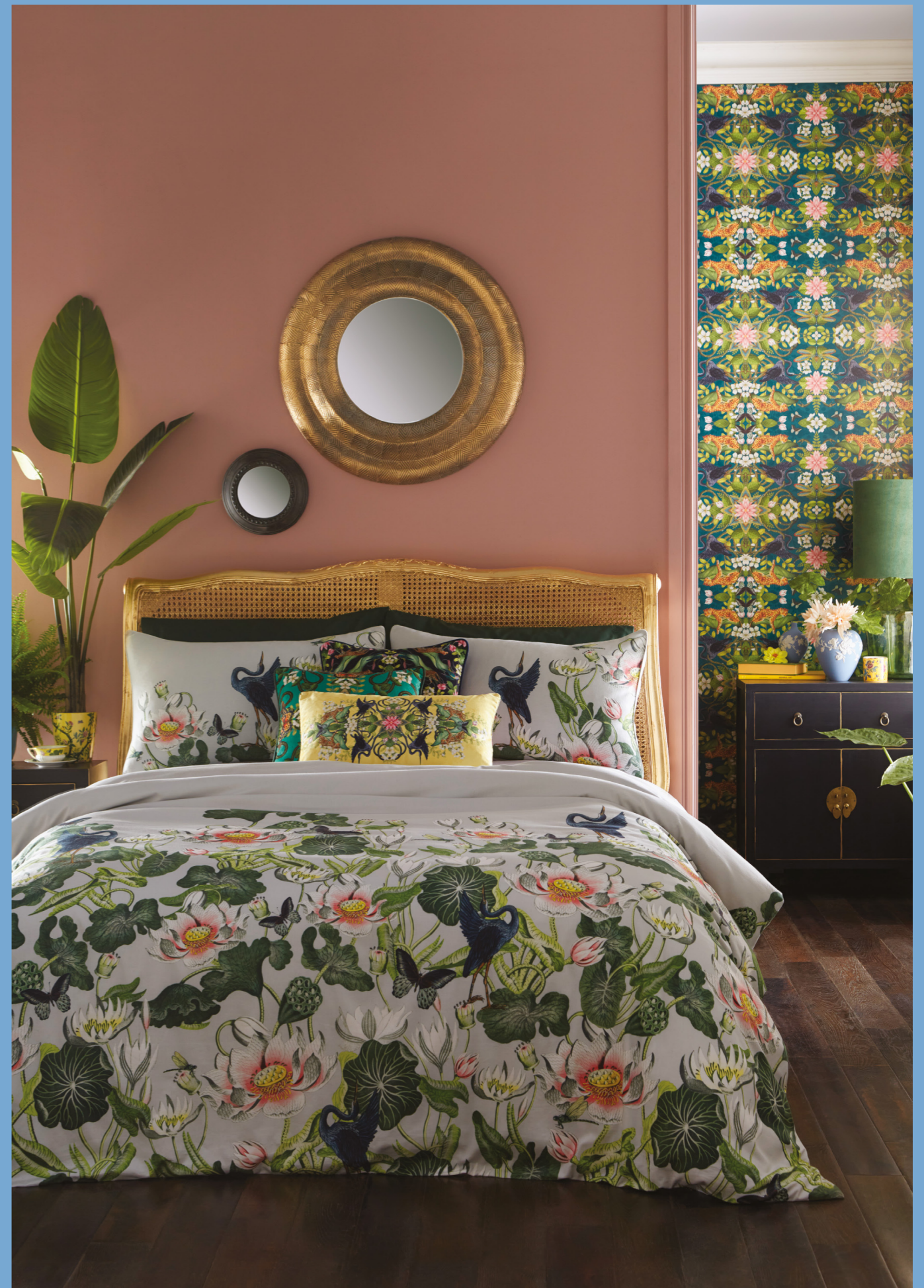
Bedlinen: Waterlily Dove Cushions front to back: Wonderlust Tea Story, Emerald Forest Emerald, Menagerie Midnight Ceramics left to right: Wonderlust Waterlily Teacup & Saucer, Magnolia Blossom Jasper Bud Vase, Magnolia Blossom Large Jasper Vase, Wonderlust Yellow Tonquin Candle Wallcovering: Wonderlust Tea Story Teal