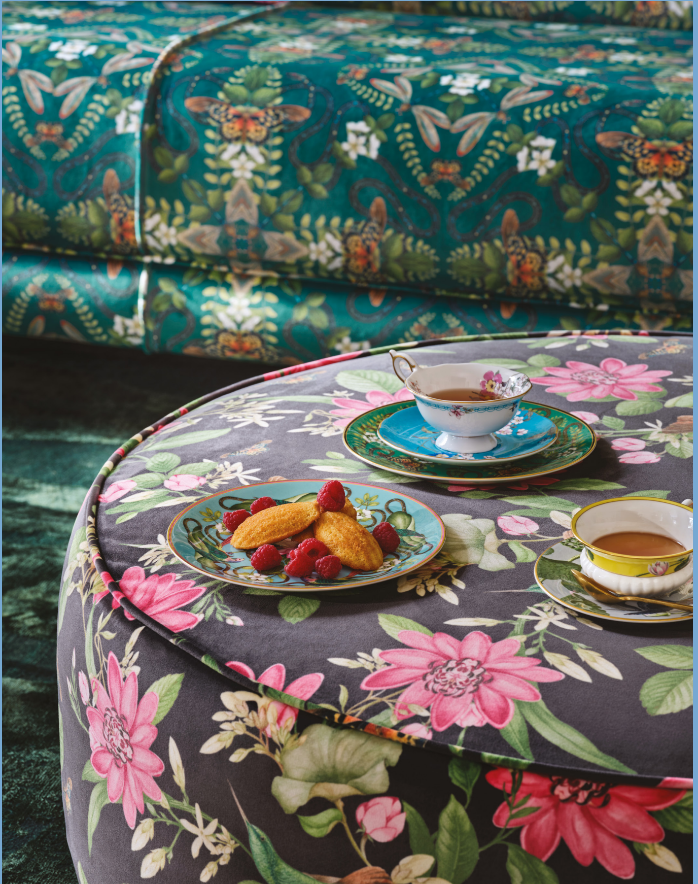
Sofa: Emerald Forest Teal Velvet Fabric Drum: Pink Lotus Noir Velvet Fabric Ceramics left to right: Wonderlust Menagerie Plate, Wonderlust Emerald Forest Plate, Wonderlust Apple Blossom Teacup & Saucer, Wonderlust Waterlily Teacup & Saucer

A symbol of inner wisdom and the sanctity of daily life, the Pink Lotus is considered a sacred flower in the tropics of Asia. Typically found in marshy swamps, it produces gigantic fragrant blossoms and leaves, a haven for flying insects such as jewelled dragonflies. The delicate balance of daily life is celebrated in this bold and beautiful pattern.