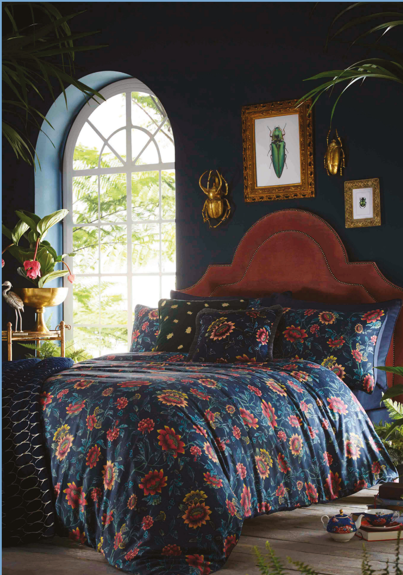
Left to right Throw: Renaissance Midnight Bedlinen: Tonquin Midnight Cushions: Firefly Emerald, Tonquin Midnight Ceramics: Paeonia Blush Tea for one