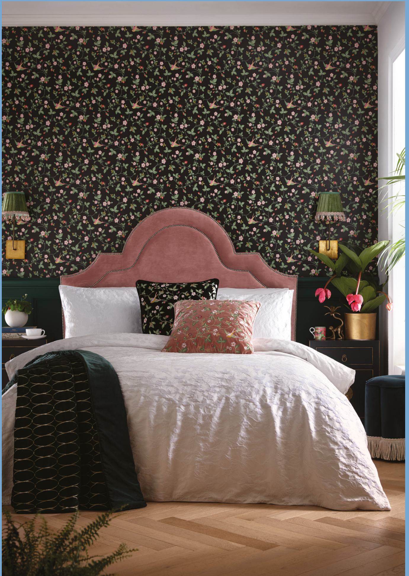
Wallcovering: Wild Strawberry Noir Cushions front to back: Wild Strawberry Blush, Noir Bedlinen: Wild Strawberry White Throw: Renaissance Emerald Ceramics left to right: White Folia Rose Bowl, Wild Strawberry White Teacup & Saucer, Wonderlust Pink Lotus Mug