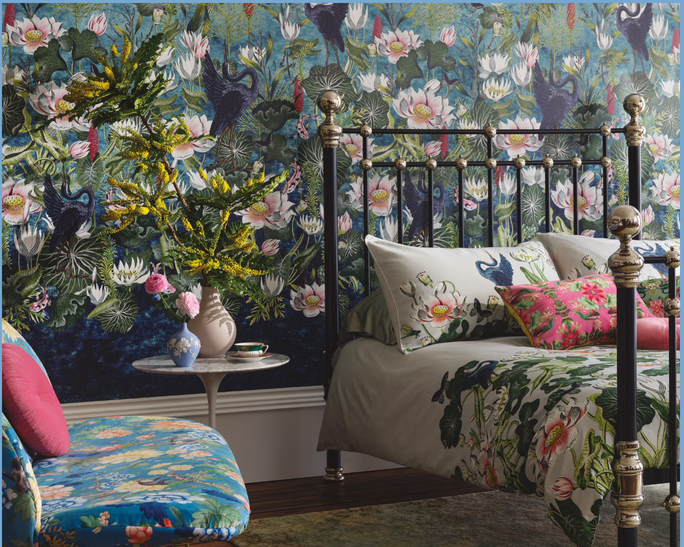
(Top left) Ceramics: Wild Strawberry Teacup & Saucer Peony and White Folia Rose Bowl Wallcovering: Waterlily Dove Sofa: Waterlily Blush Velvet Fabric Cushions left to right: Wild Strawberry Noir, Menagerie Midnight (Top right) Bedlinen: Waterlily Dove Ceramics: Magnolia Blossom Large Jasper Vase (Bottom) Wallcovering: Waterlily Marine Banner Chair: Sapphire Garden Sapphire Velvet Fabric Bedlinen: Waterlily Dove Cushions left to right: Wonderlust Tea Story, Menagerie Aqua Ceramics: Magnolia Blossom Jasper Bud Vase, Jasper Folia Powder Pink Bulb Vase, Wonderlust Pink Lotus Teacup & Saucer