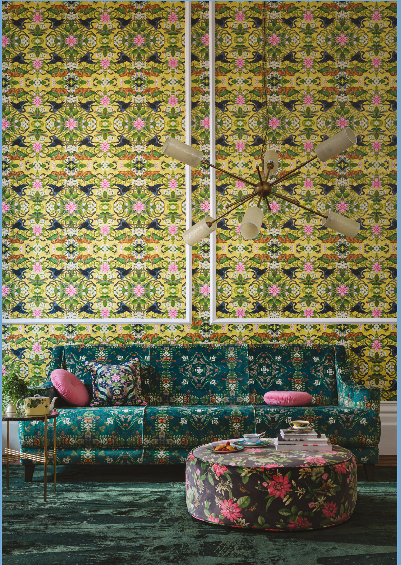
(Front page) Cushion: Wonderlust Tea Story Citron Wallcovering: Waterlily Marine Banner Bedlinen: Waterlily Dove Cushions front to back: Emerald Forest Teal Jacquard Fabric, Midnight Jacquard Fabric, Blush Jacquard Fabric, Waterlily Midnight Velvet Fabric (Above) Wallcovering: Wonderlust Tea Story Citron Sofa: Emerald Forest Teal Velvet Fabric Cushions: Alvar Candy Fabric, Menagerie Midnight Drum: Pink Lotus Noir Velvet Fabric Ceramics: Wonderlust Menagerie Plate, Wonderlust Apple Blossom Teacup & Saucer Wonderlust Emerald Forest Plate, Wonderlust Waterlily Teacup & Saucer