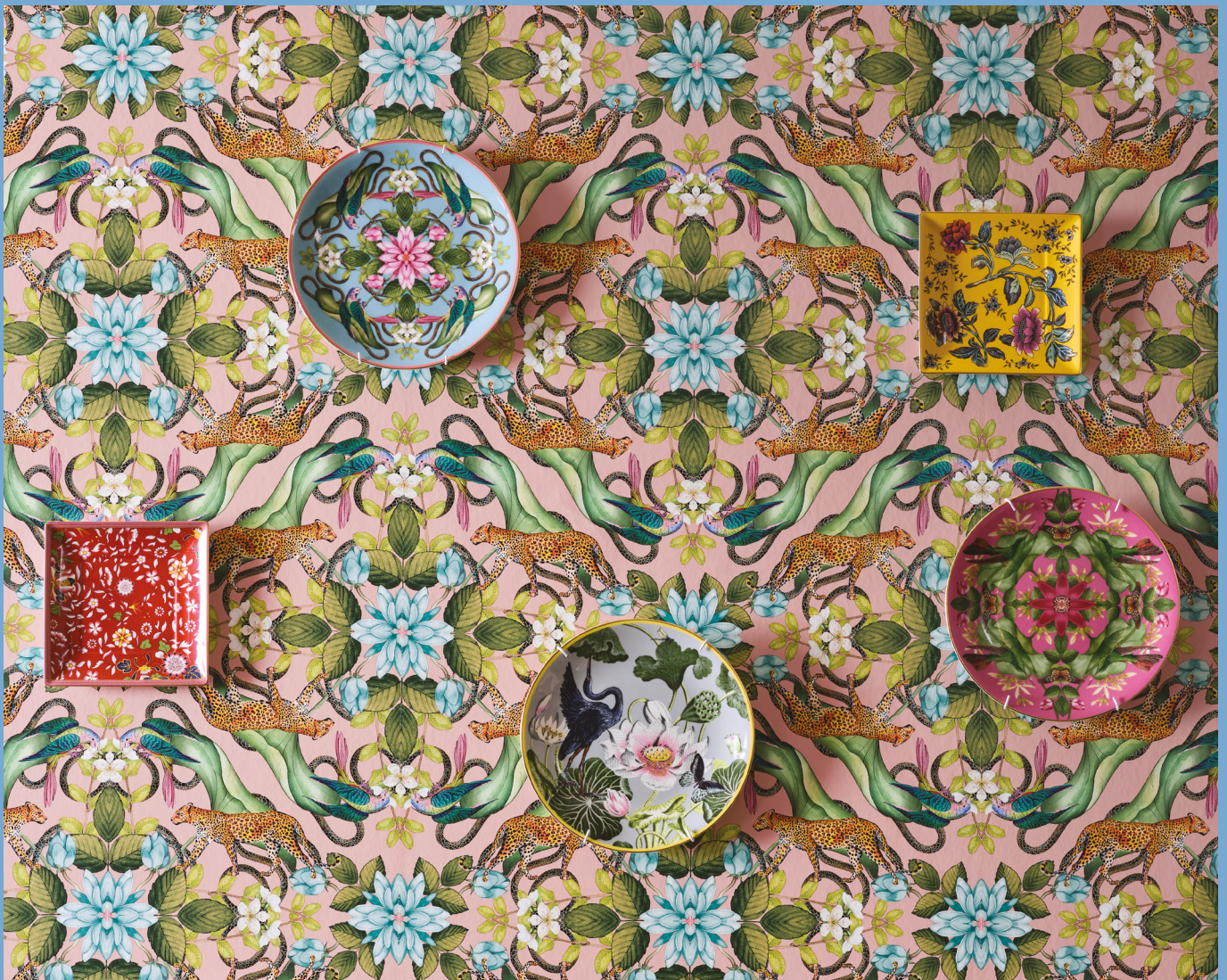
(Top left) Bedlinen: Magnolia Wedgwood Jasper Cushion: Menagerie Aqua (Top right) Wallcovering: Tonquin Midnight Armchair: Menagerie Aqua Fabric Cushion: Wonderlust Tea Story Teal Velvet Fabric (Bottom) Wallcovering: Menagerie Blush Ceramics left to right: Wonderlust Crimson Jewel Tray, Wonderlust Menagerie Plate, Wonderlust Waterlily Plate, Wonderlust Yellow Tonquin Tray, Wonderlust Pink Lotus Plate