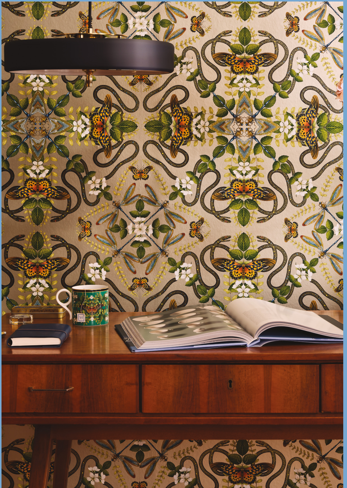
Wallcovering: Emerald Forest Gilver Ceramics: Wonderlust Emerald Forest Mug