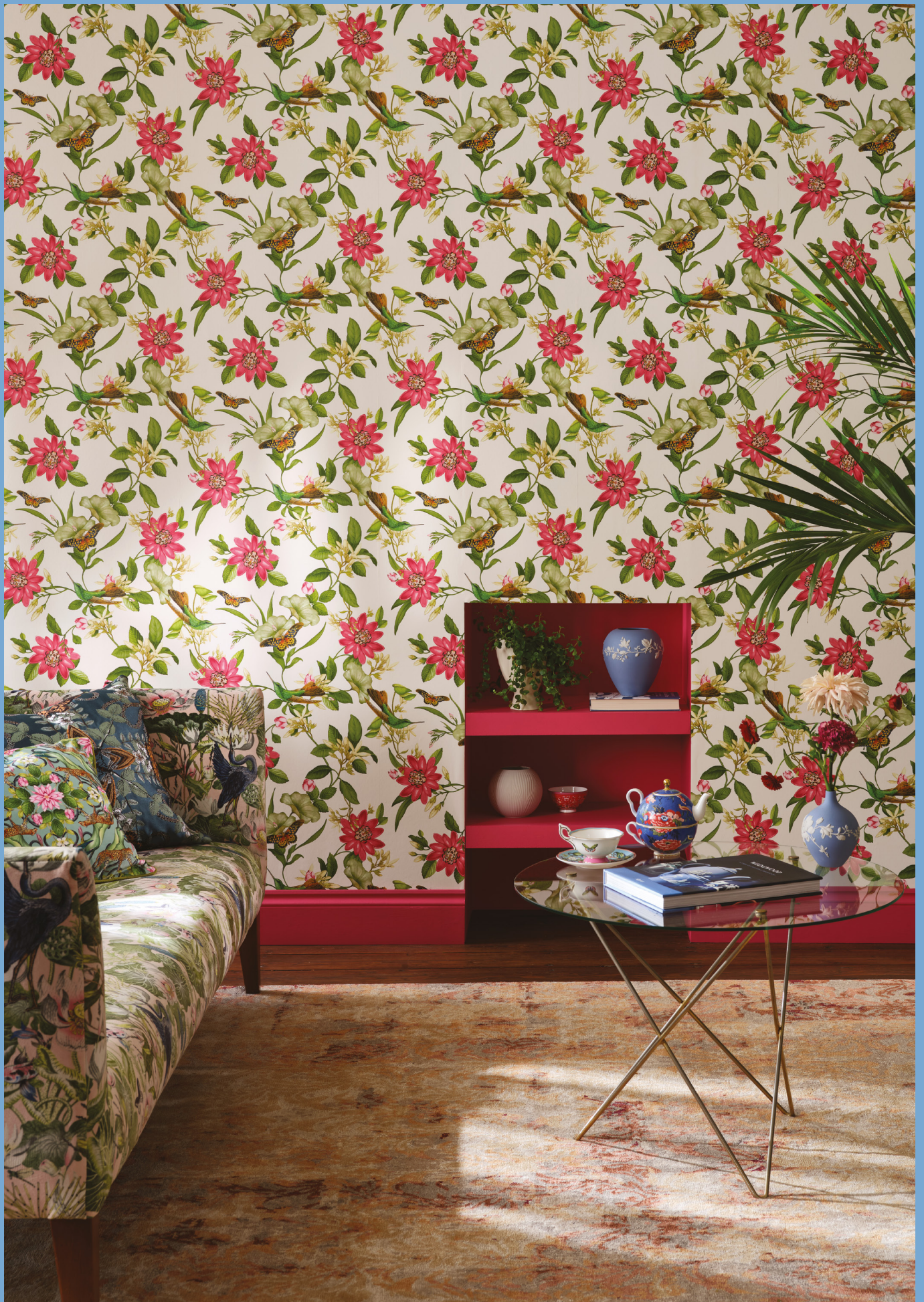
Wallcovering: Pink Lotus Ivory Sofa: Waterlily Blush Velvet Fabric Cushions left to right: Managerie Aqua, Emerald Forest Teal Jacquard Fabric Ceramics left to right: Jasper Folia Warm White Rose Bowl, Wonderlust Crimson Jewel Bowl, Wonderlust Menagerie Teacup & Saucer, Magnolia Blossom Large Jasper Vase, Paeonia Blush Tea for one, Magnolia Blossom Jasper Bud Vase (Back page) Wallcovering: Wild Strawberry Noir Cushions top to bottom: Wild Strawberry Blush, Noir Throw: Renaissance Emerald Ceramics: White Folia Rose Bowl