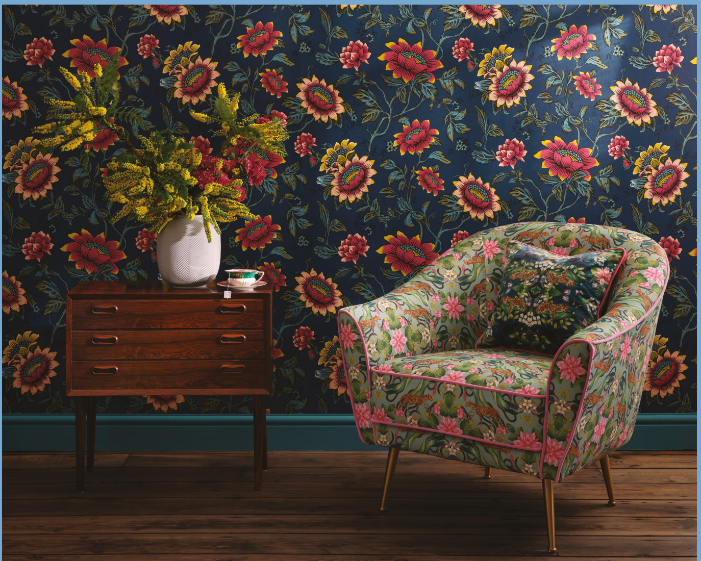
(Top left) Cushion: Firefly Emerald Bedlinen: Tonquin Midnight (Top right) Ceramics: Paeonia Blush Tea for one Bedlinen: Tonquin Midnight (Bottom) Ceramics: Jasper Folia Dove Grey Rounded Vase, Wonderlust Pink Lotus Teacup & Saucer Wallcovering: Tonquin Midnight Armchair: Menagerie Aqua Fabric Cushion: Wonderlust Tea Story Teal Velvet Fabric