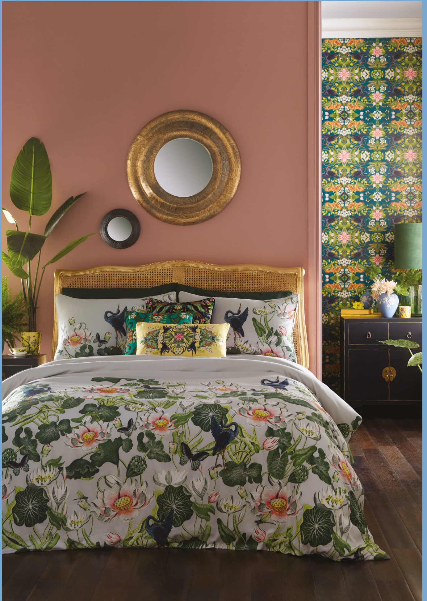
Bedlinen: Waterlily Dove Cushions front to back: Wonderlust Tea Story, Emerald Forest Emerald, Menagerie Midnight Ceramics left to right: Wonderlust Waterlily Teacup & Saucer, Magnolia Blossom Jasper Bud Vase, Magnolia Blossom Large Jasper Vase, Wonderlust Yellow Tonquin Candle Wallcovering: Wonderlust Tea Story Teal